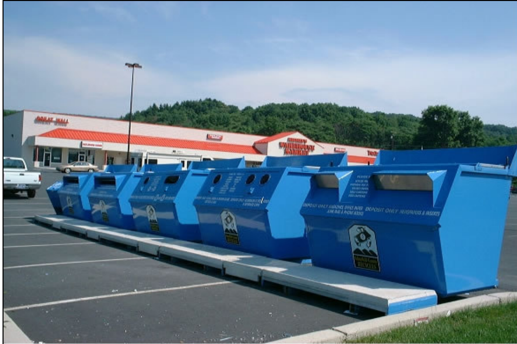
Figure 1 Haul All Depot System

As this Recycling Technical Assistance Program project concluded, the Crawford County SWA was facing financial sustainability problems due to a loss of funding to pay the cost of its drop-off program. The problems were serious and in February 2007 the Crawford County SWA announced that it would shutter its Haul All depot sites. The results of R. W. Beck's analysis of the Haul All depot option is still included in this report for reference sake, in the event that the Crawford County SWA is able to resume service using its Haul All depot equipment.