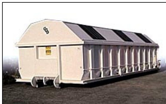
Figure 3 Recycling Roll-Off Container

The capital cost to purchase roll-off containers varies by manufacturer and by size of the container. The Partner Municipalities can expect to pay from $10,500 to $14,000 per roll-off for a 30 cubic yard size, depending on the complexity of the design and quality of construction. One roll-off would be located at each drop-off site. Roll-off container capital costs would therefore range from $10,500 to $28,000, depending on the manufacturer selected, and whether one or two drop-off sites would be operated.