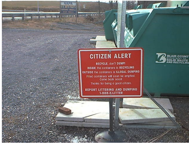
Figure 3 Blair County Illegal Dumping Sign, Example 1