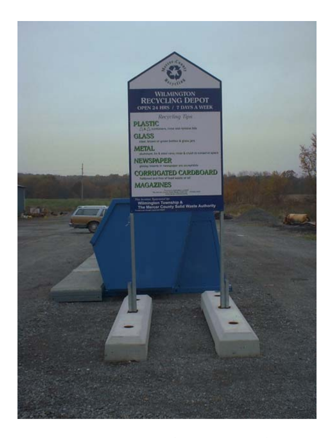
Figure 4 Mercer County Material Definition Sign

In Schuylkill County, we have attempted to provide County-specific definitions targeted recyclable materials, as well as graphical examples of targeted recyclables. The resulting sign is shown in the first Attachment. It is envisioned that this sign can be placed at any of several locations as preferred by the County: