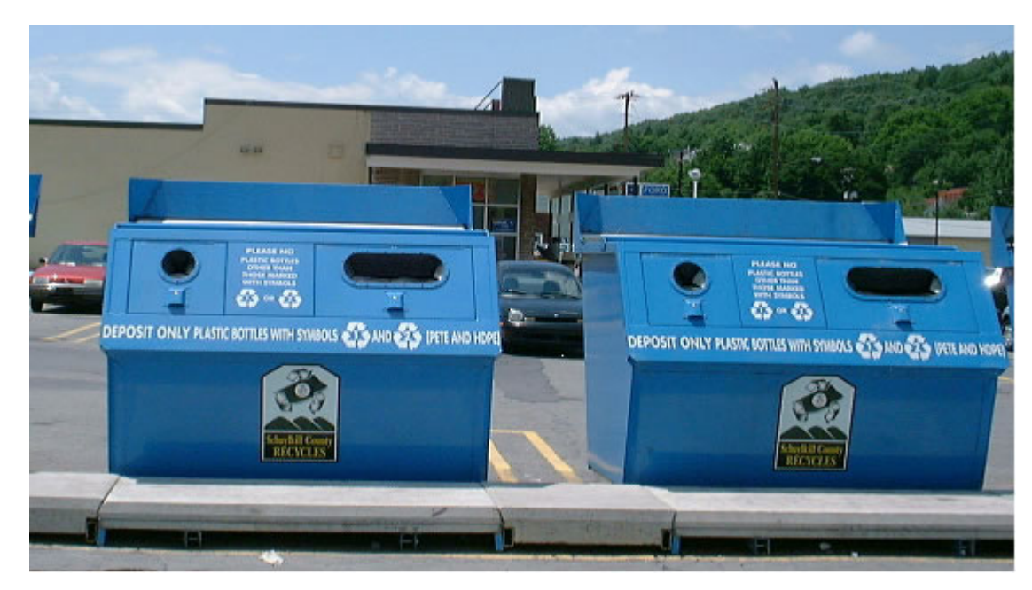
Figure 1 Schuylkill County Drop-off Site at Ashland