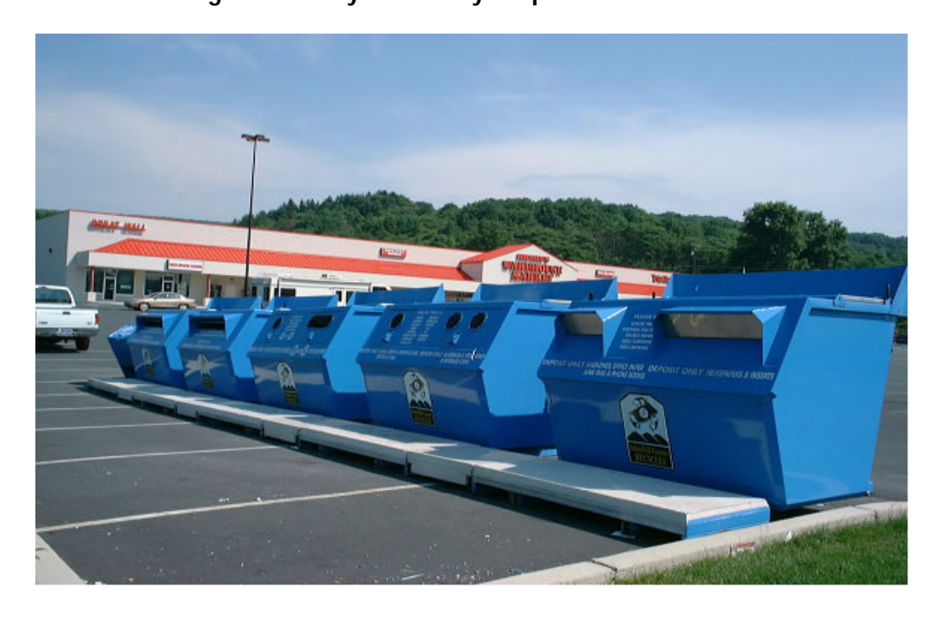
Figure 2 Schuylkill County Drop-off Site at North Manheim