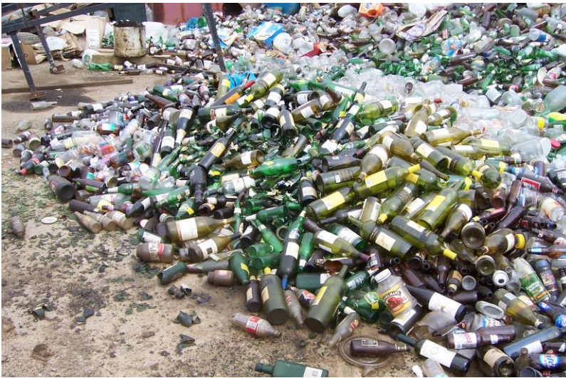
Figure 9: Glass at Perry County Metals.

Figure 9 below shows a pile of glass as dumped right out of the roll-off, without distinct separation by color.