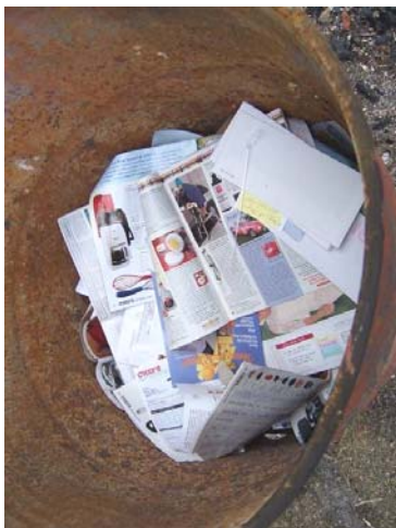
Figure 10: Backyard Burn Barrel.

Materials that are targeted for recycling are often found in burn barrels. Figure 10 below, taken during R. W. Beck's site visit to Perry County, shows home office paper/catalogs/magazines in a burn barrel. Although currently not collected in the County's program, this grade of paper is a revenue-generating commodity in most markets. It is highly likely that other recyclable materials such as newspapers and cardboard are commonly burned in backyard barrels.