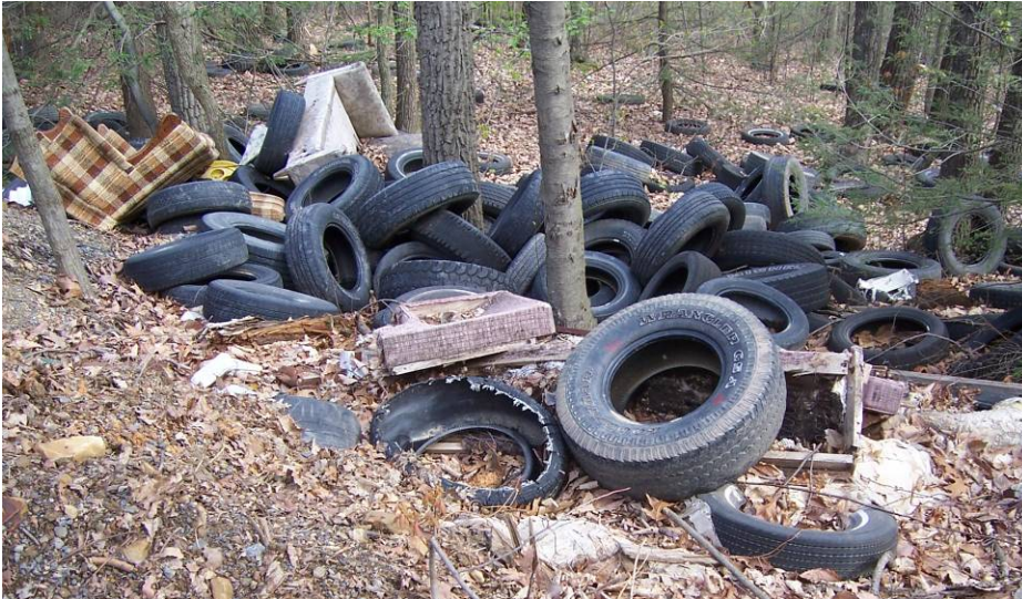
Figure 5: Illegal Dumpsite.

In early 2005, the County conducted a survey and identified 41 illegal dumpsites located throughout Perry County. A map of the illegal dumpsites is shown in Figure 6 below.