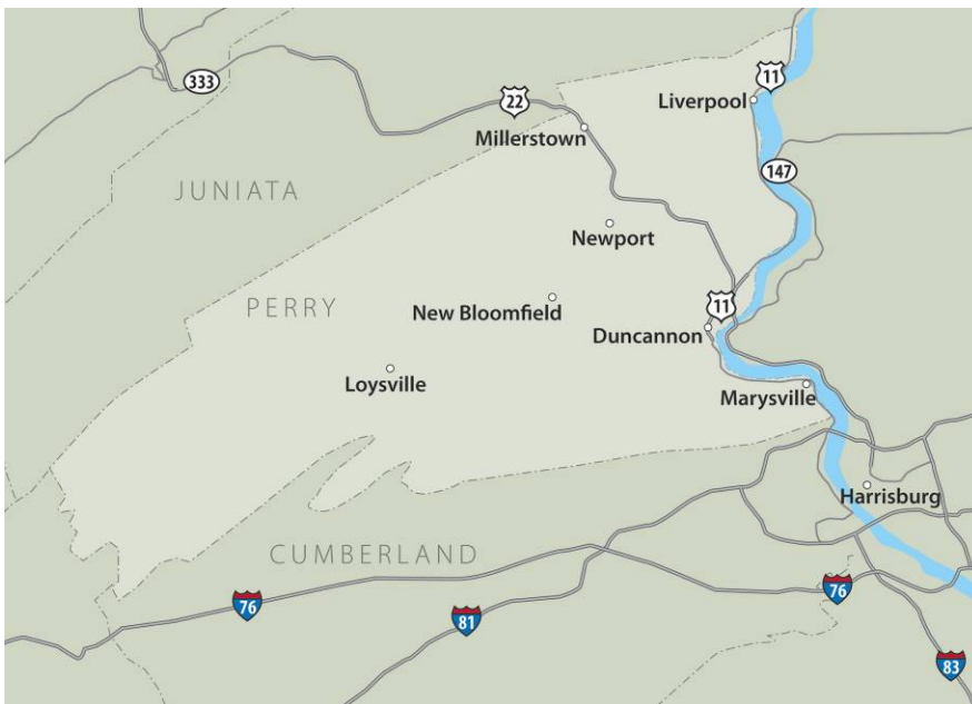
Figure 1: Map of Perry County Recycling Collection Centers.

The map in Figure 1 below shows the distribution of the recycling centers throughout the County. (Harrisburg is shown as a reference point.)