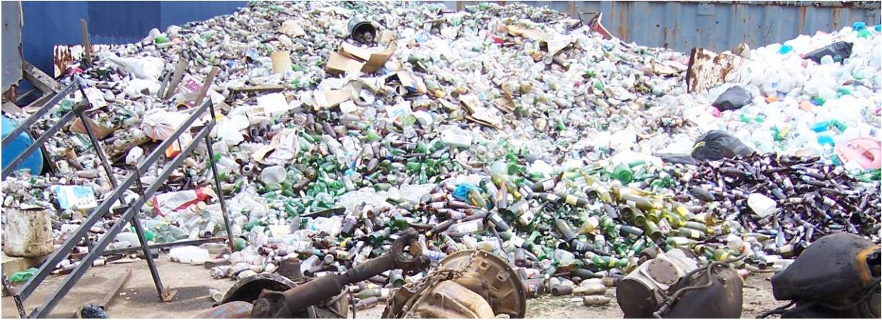
Figure 8: Recyclable Materials at Perry County Metals.

Figure 9 below shows a pile of glass as dumped right out of the roll-off, without distinct separation by color.