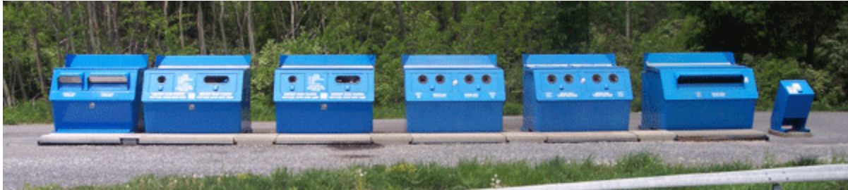
Figure 7: Haul-All Recycling Collection Containers in Cambria County, Pennsylvania.

In comparing the type of drop-off system used by the benchmarked communities, Cambria, Mercer, and Schuylkill Counties all use the “Haul-All” brand recycling container system, as shown in Figure 7. Venango uses front-load containers and Centre County uses compartmentalized containers.