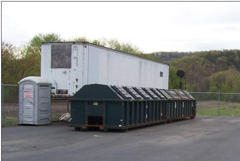
Figure 2: Recycling Collection Center Compartmentalized Container.

The County owns ten (seven 30-yard and three 34-yard) roll-off containers and the contracted hauler, Perry County Metals, provides additional containers as needed. To discourage illegal dumping at the collection sites, Perry County Metals drops off the containers right before the collection day and removes them right after the collection day. Two of the sites are enclosed by a chain-link fence and have permanent signage; the others are located in open parking lots and do not have any signage.