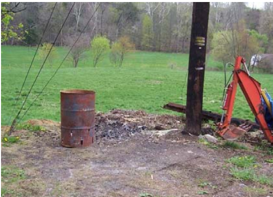
Figure 3: Typical Burn Barrel.

Residents in Perry County are not mandated to subscribe to or contract with a collection company for the removal of municipal solid waste (MSW). A substantial number of residents have burn barrels on their property (see Figure 3) and burn their own garbage. Often, the ash (Figure 4) and non-burnable items are thrown behind the burn barrel or thrown in roadside ditches and in wooded areas throughout the County. Figure 5 shows an illegal dumpsite containing tires and furniture.