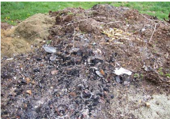
Figure 4: Ash from Burn Barrel.