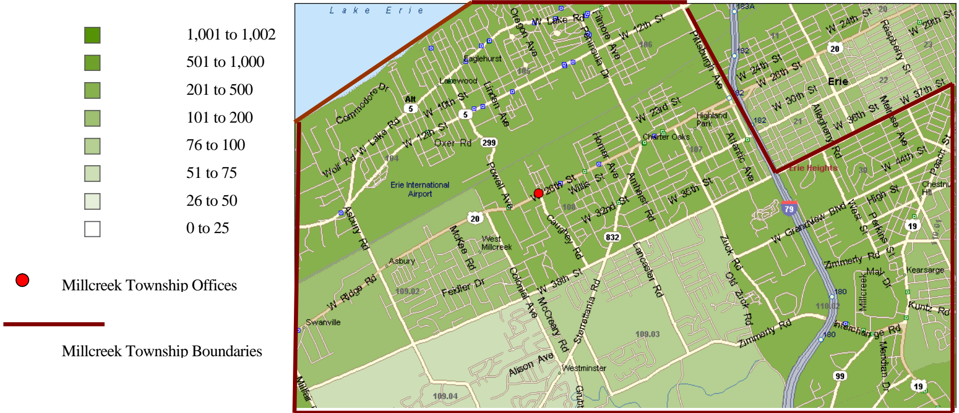
Figure 1 Concentration of Erie County Commercial Businesses