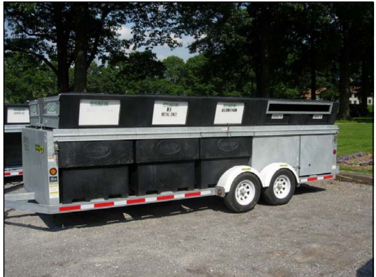
Figure 2 Recycling Trailer Used At Permanent Trailer Sites

The Center has 16 trailers to collect recyclables at the permanent drop-off sites. The Center currently operates five Circuit Rider collection sites during March through December and 12 permanent trailer collection sites year round. The Circuit Rider sites are generally available to receive materials for a two to four hour periods. Ford City Borough is the only municipality that has two trailer sites. The Center recently reduced the number of Circuit Rider program sites from thirteen to five, changing some to permanent trailer sites. In the County, Kittanning and Leechburg boroughs provide residents with curbside collection of recyclables. In addition, Leechburg Borough operates a recycling drop-off center. Figure 2 shows the recycling trailer used at permanent trailer sites. Table 1 lists the locations of the five circuit rider sites and the 12 permanent trailer sites.