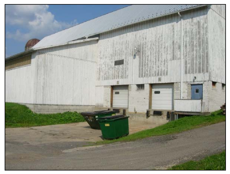
Figure 5 Armstrong Recycling Center – Proposed Southwest Expansion Area

To increase baling production at the Center, the expansion plan includes installing a new horizontal baler prepurchased by the County in the lower level of the expansion. The new horizontal baler would compact various paper products and plastic containers.