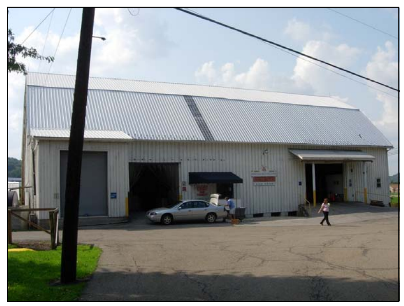
Figure 1 Armstrong County Recycling Center – Upper Front Level

Based on the observations made at the Center, R. W. Beck recommends that the County expand the Center to: