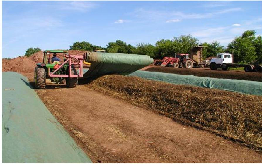
The compost fleece is placed over the windrows by a tractor driven roller system.