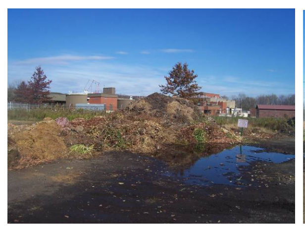
Figure 3 – City of Corry

A grinder is used initially to size reduce the leaf and yard debris material, which is then placed into a windrow.