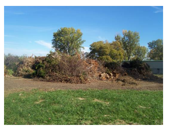
Figure 2 – Fairview Evergreen Nurseries

The pictures below show the raw materials and composted material ready for land application.