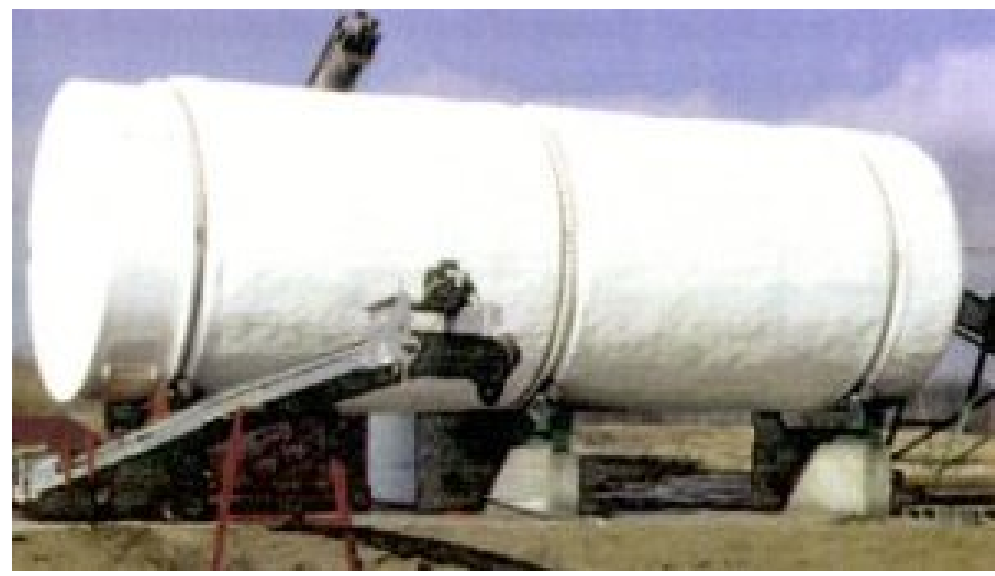
Figure 1 BW Organics Stationary Rotating Drum