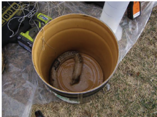
Recovered absorbent sock from well at [REDACTED] 1-5-26 @ 9:12