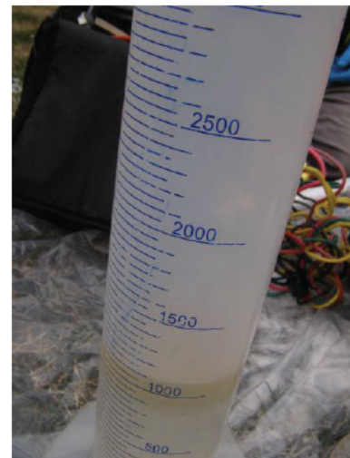
Amount of LNAPL recovered from [REDACTED] (150mL) 1-5-26 @ 9:41