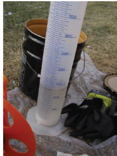
Bailed water from potable well at [REDACTED] 1-5-26 @ 9:16