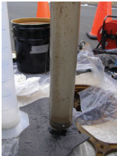
Skimmer removed from recovery well RW-3 on Glenwood Drive 1-5-26 @ 10:12