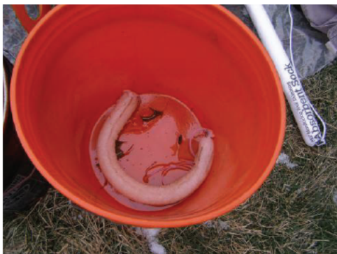
Recovered absorbent sock from well at [REDACTED] 1-5-26 @ 9:36