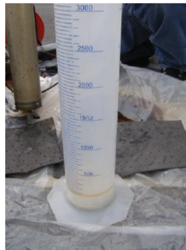
Amount of LNAPL recovered from RW-3 (130 mL) 1-5-26 @ 10:14