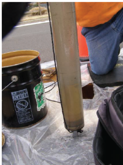
Skimmer removed from recovery well RW-3 on Glenwood Drive 1-5-26 @ 10:22