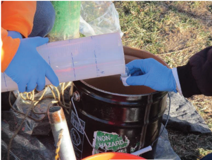
Sample collection from [REDACTED] well.