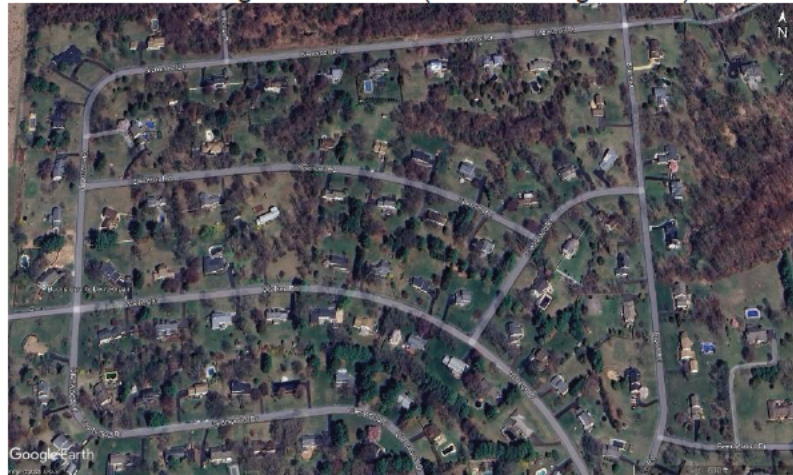
Map of Proposed Well Locations