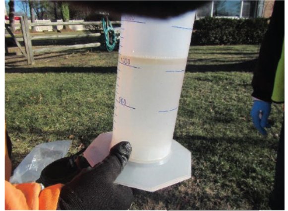
Bailed water and product from [REDACTED] well.