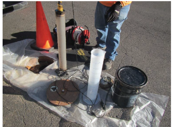
Skimmer removal from RW-2.