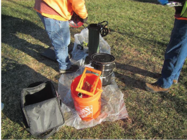
Gauging of [REDACTED] well.