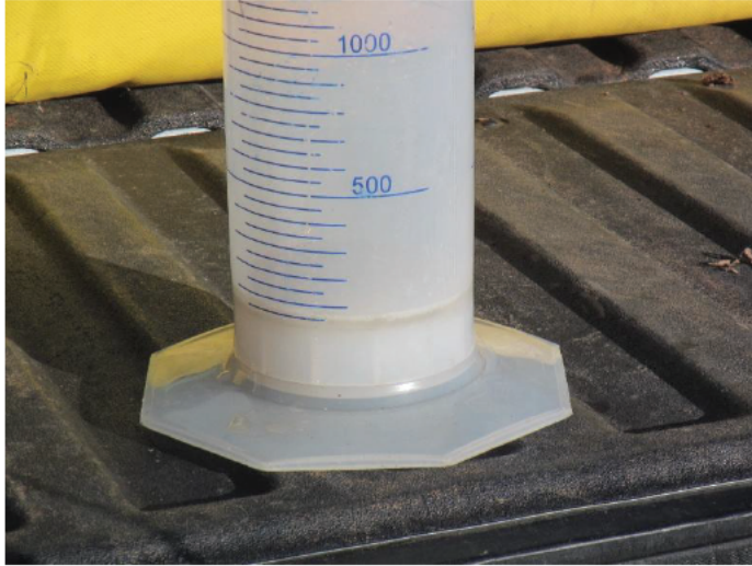
Accumulated product from RW-2 skimmer.