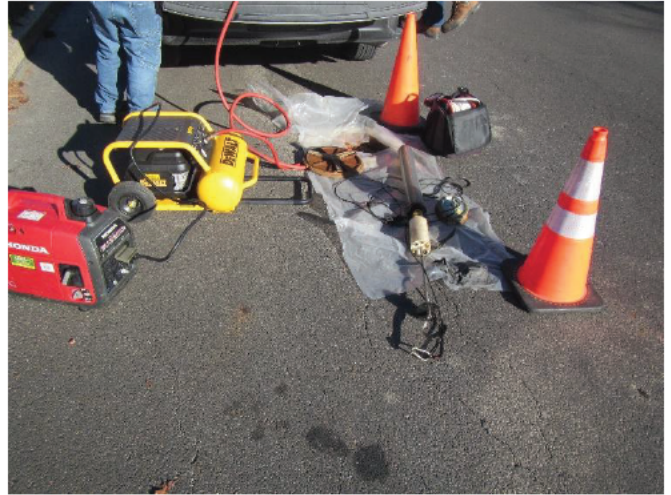
Pumping setup at RW-2.