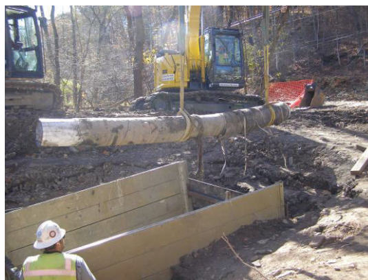
20-foot section of pipeline that was removed 11-5-25