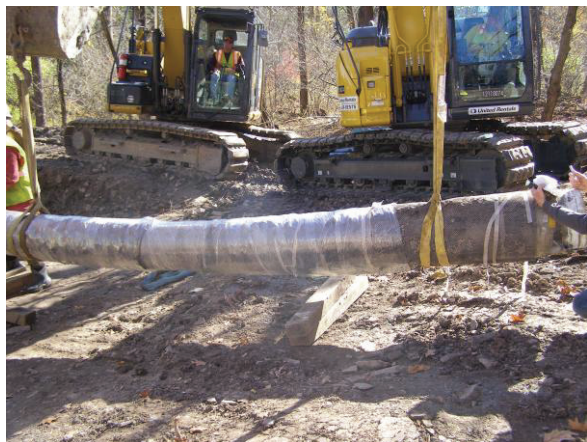
Removed pipeline wrapped in plastic to be sent to TX 11-5-25