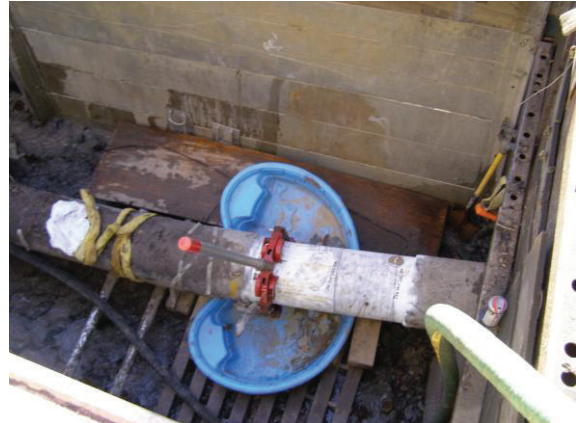
Kiddie pool placed under pipe to catch any remaining fluid in the pipe when cut 11-5-25