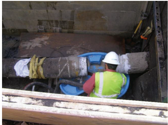
Small section of pipeline cut 11-5-25