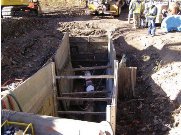
Looking East at pipe replacement area 11-5-25