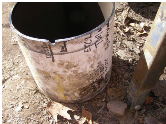
Closeup of section of pipe cut out 11-5-25