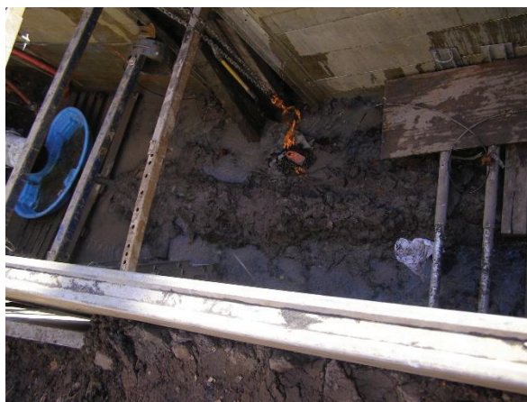
Excavation with section of pipe gone 11-5-25