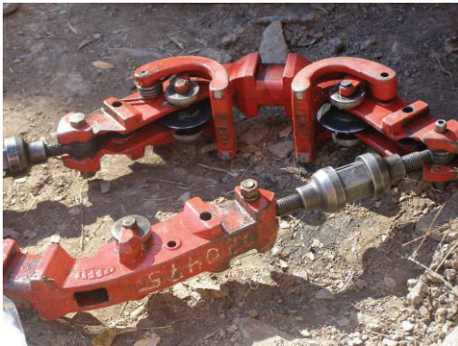
Cold cut clam device to cut pipe 11-5-25