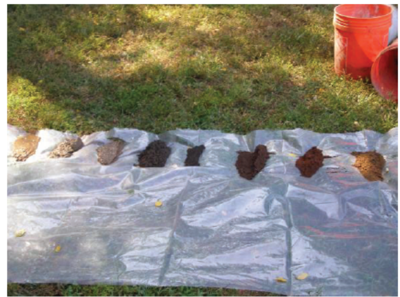
5 feet -----> 40 feet Soil samples from every 5 feet while installing MW-13S 9-15-25 @10:35