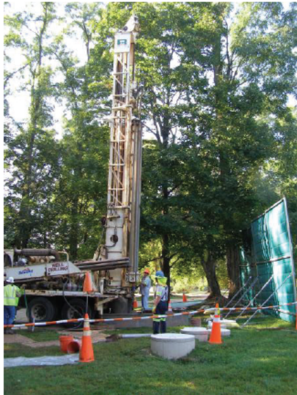
Drill rig set up at [redacted] 9-15-25 @ 9:37am