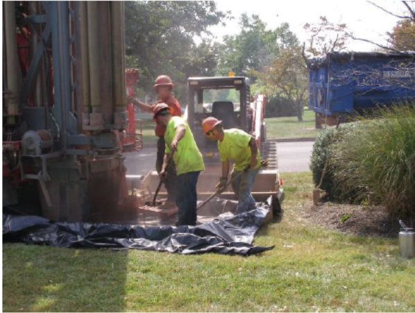
Drill rig set up at [redacted] 9-15-25 @ 12:28