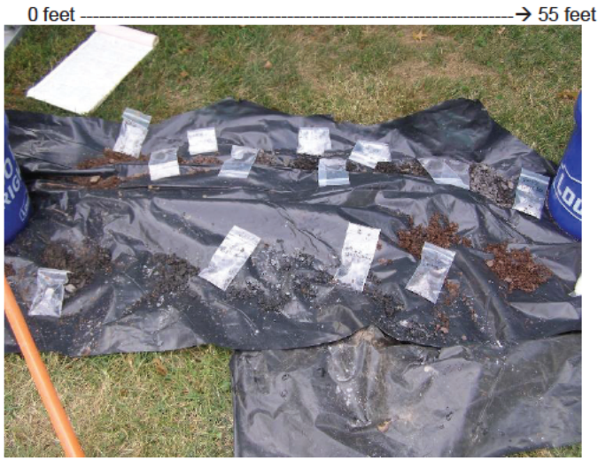
0 feet -----> 55 feet 60 feet -----> 80 feet Soil samples every five feet in new potable well at [redacted] from 0-81 feet bgs 9-15-25 @ 16:11