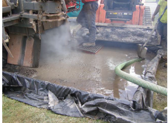
Water from installing potable well at [redacted] before going into the vacuum truck on site 9-15-25 @ 15:35