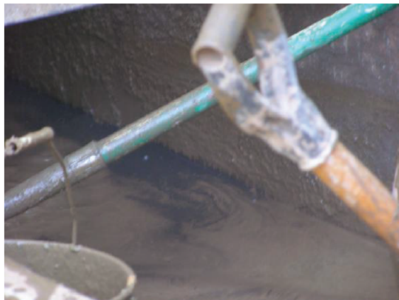
Coal shale on water from monitoring well MW-13S at [redacted] 9-15-25 @10:34