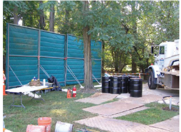
Sound barriers set up at [redacted] 9-15-25 @ 9:39