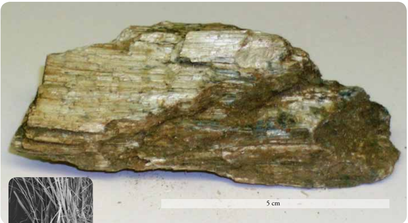
Photo of asbestiform tremolite, El Dorado County, California seen in hand sample (above) and scanning electron micrograph (left)