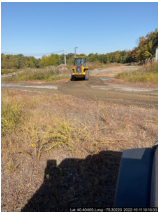
Grading haul road to pit near the garage