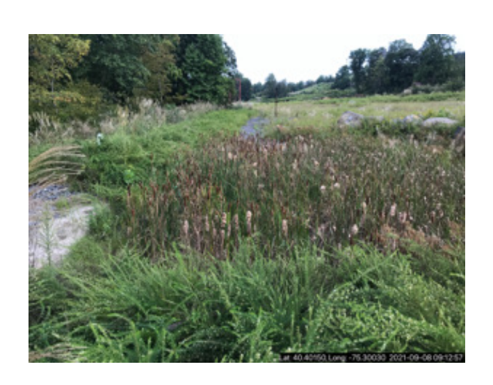
Smaller sed trap