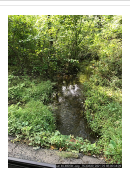
Inlet side of Rockhill Rd