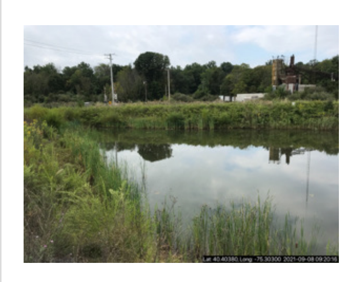
Basin next to entrance