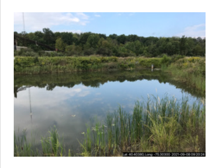
Basin next to entrance outlet