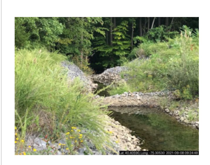
Outlet area of discharge channel