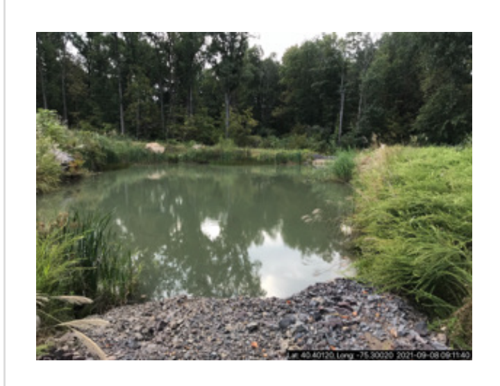
Far sed trap