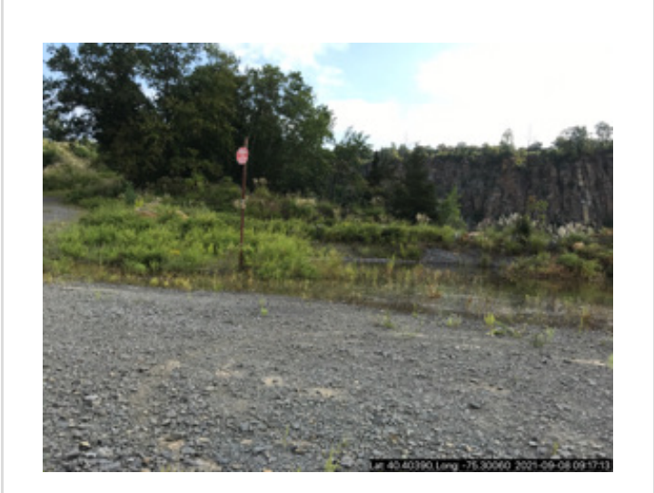
Pit water covering water truck fill area