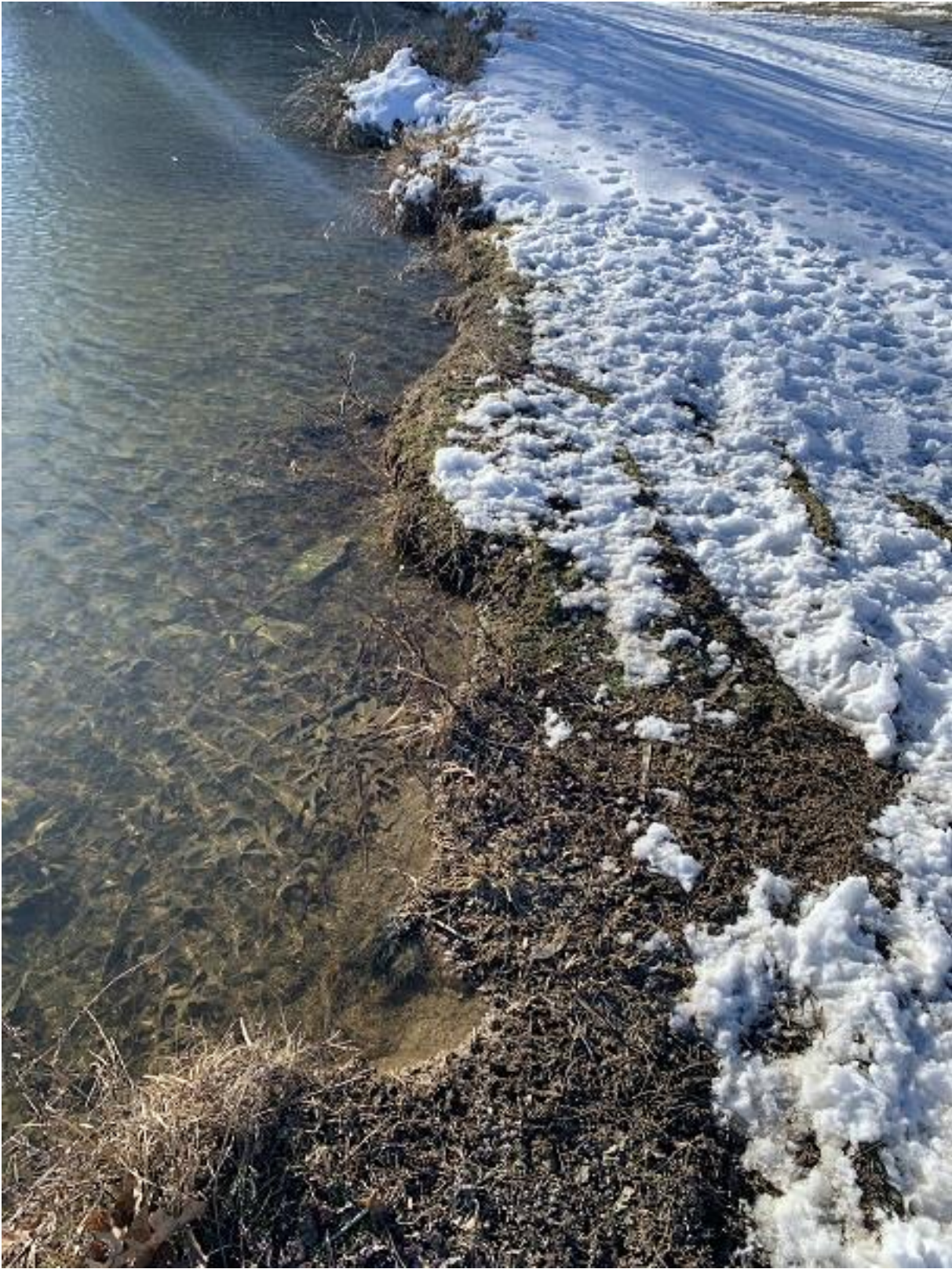
Pond upgradient of wetland area