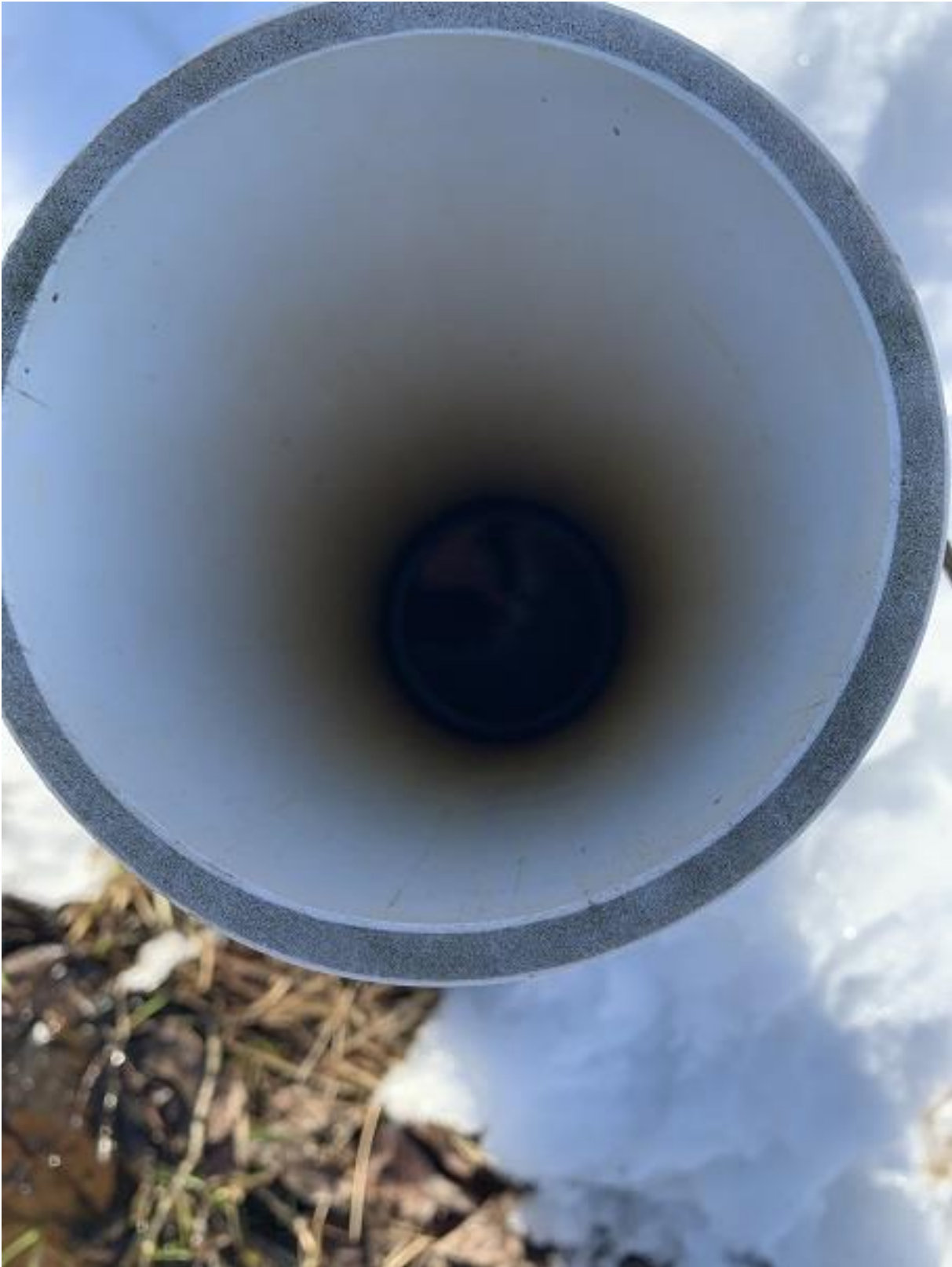
Water level in PVC pipe