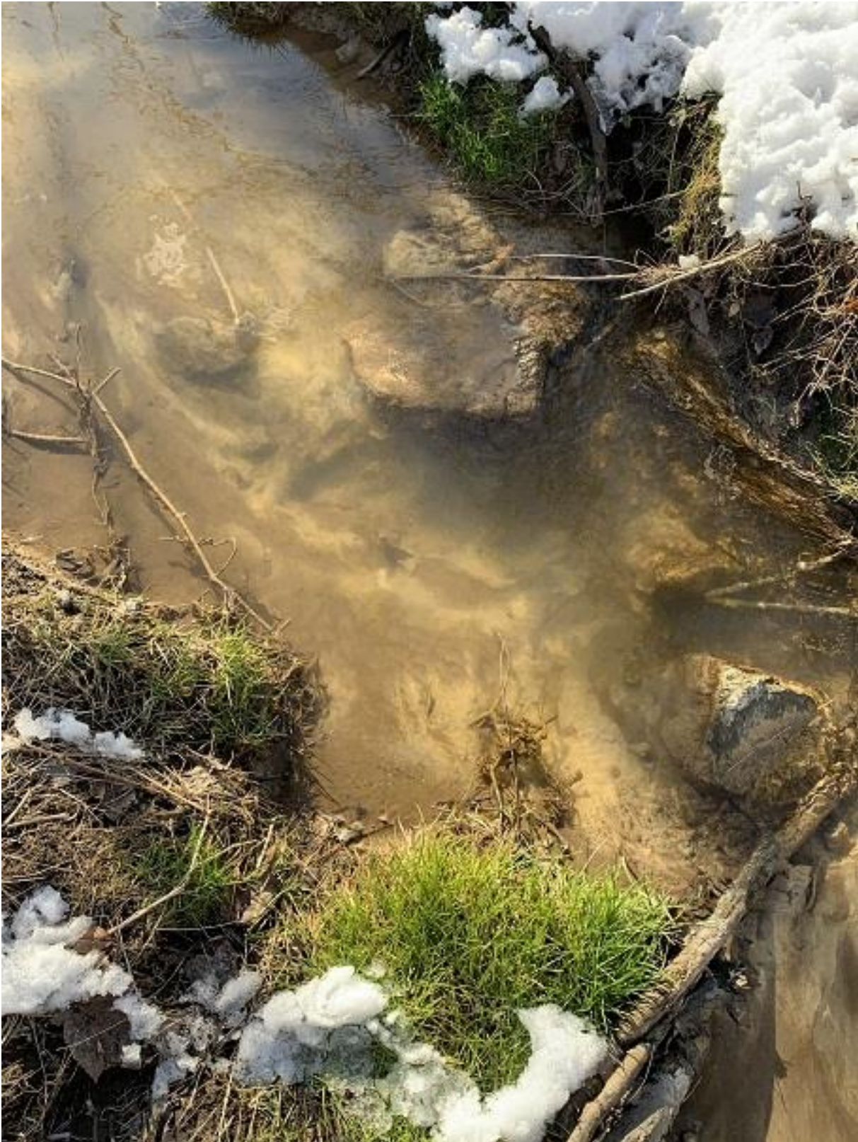
White coloration in tributary behind homes on Waterview Road