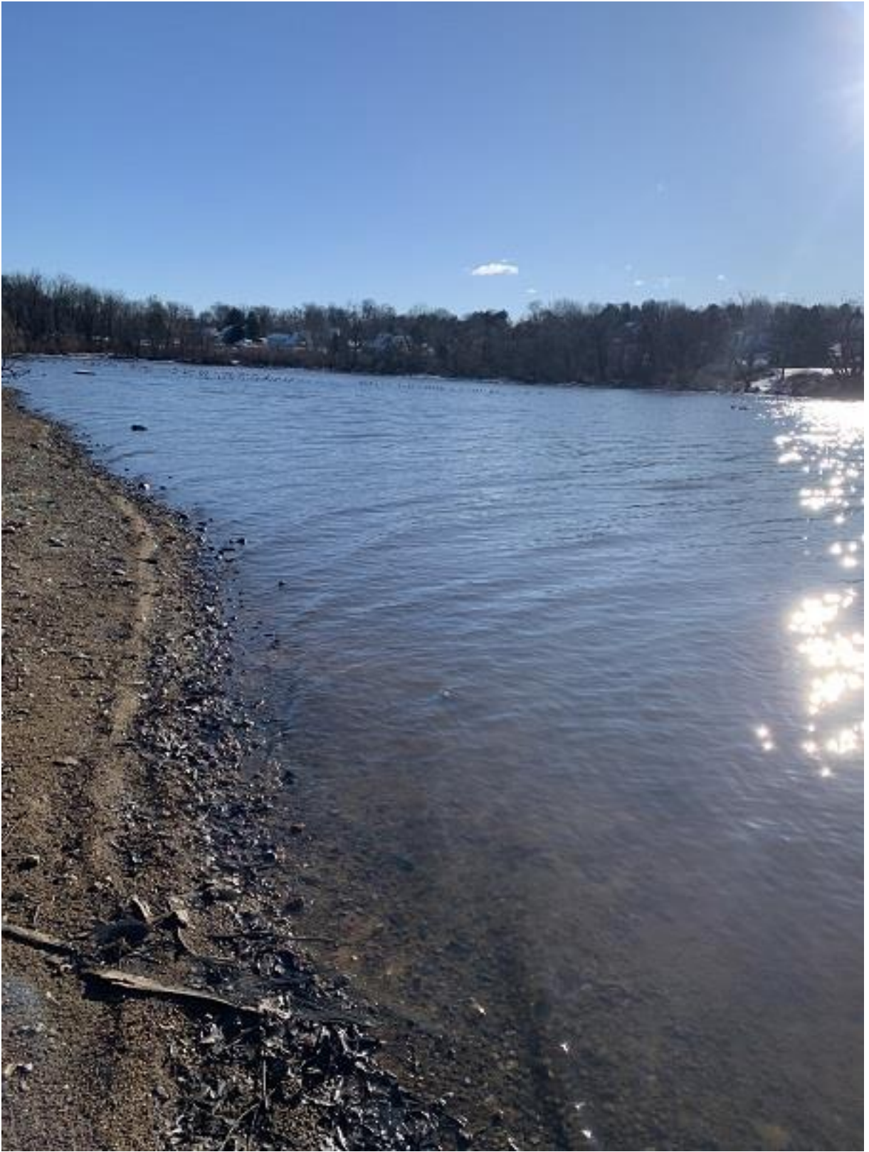
Shoreline of “Ranger Cove”