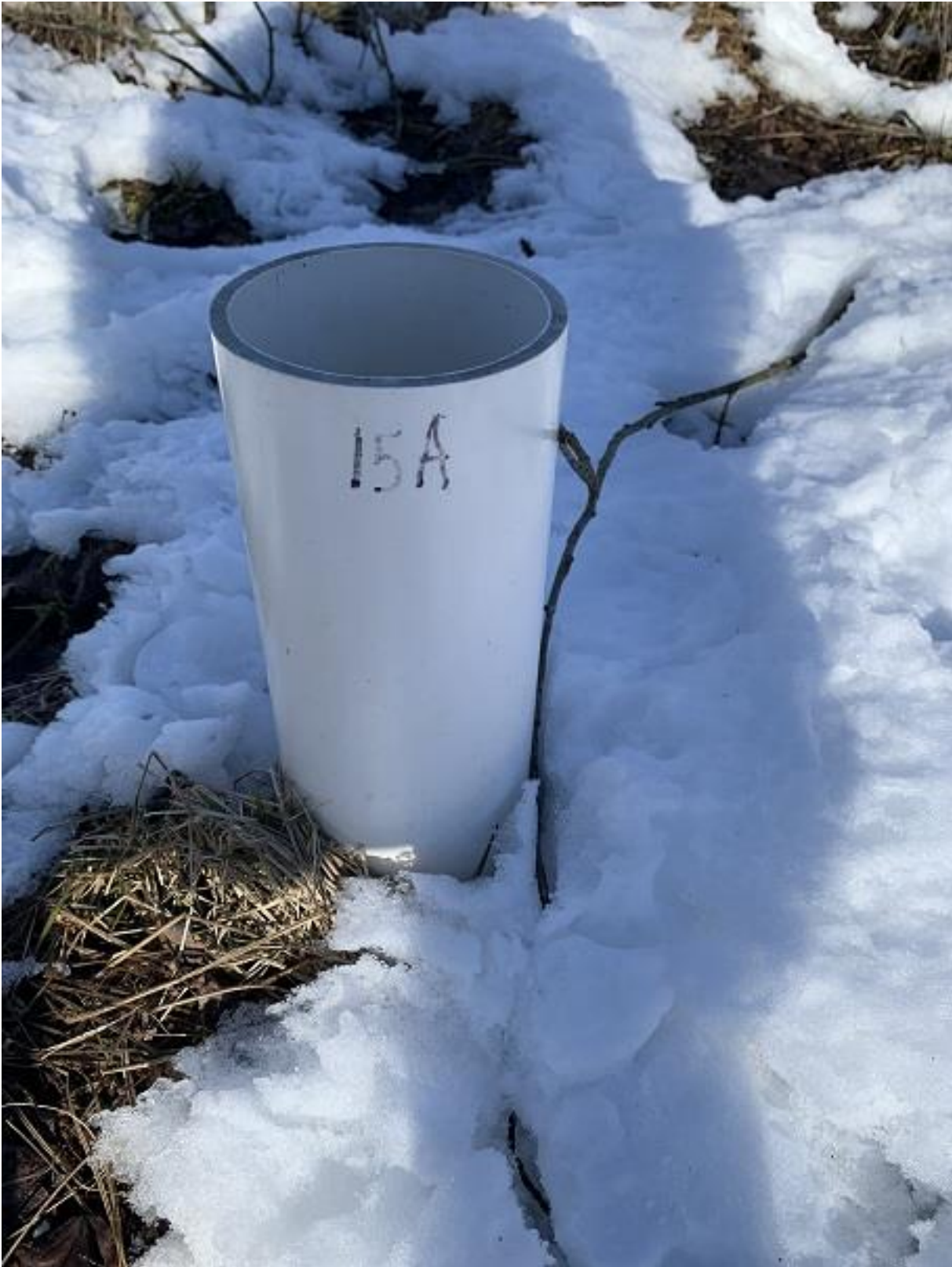
PVC Pipe next to piezometer