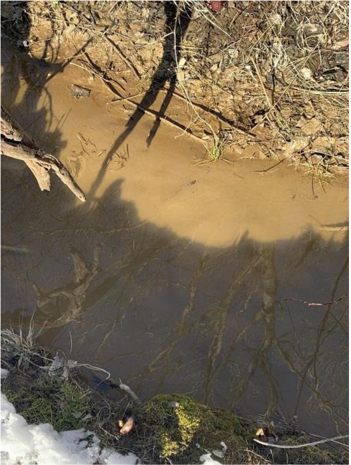
Tributary below wetland area