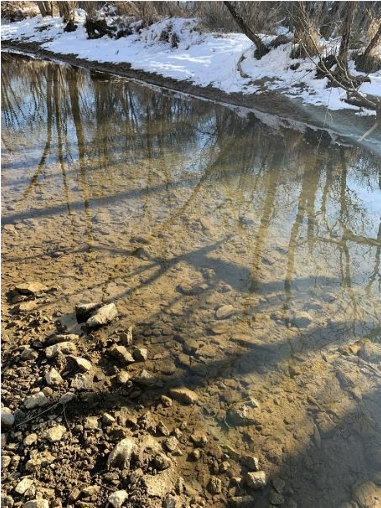
Tributary entering “Ranger Cove”