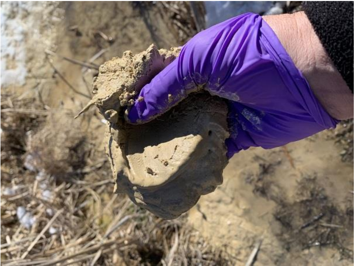
Material in wetland area