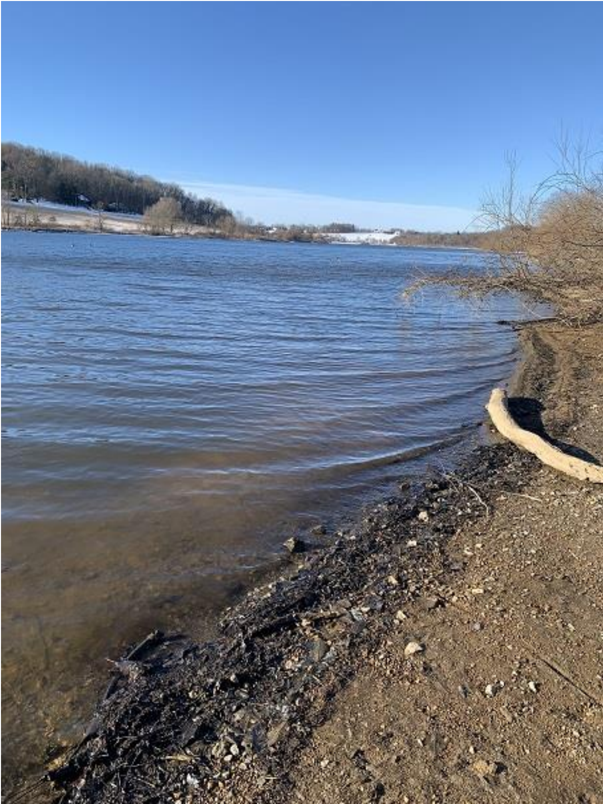
Shoreline of “Ranger Cove”