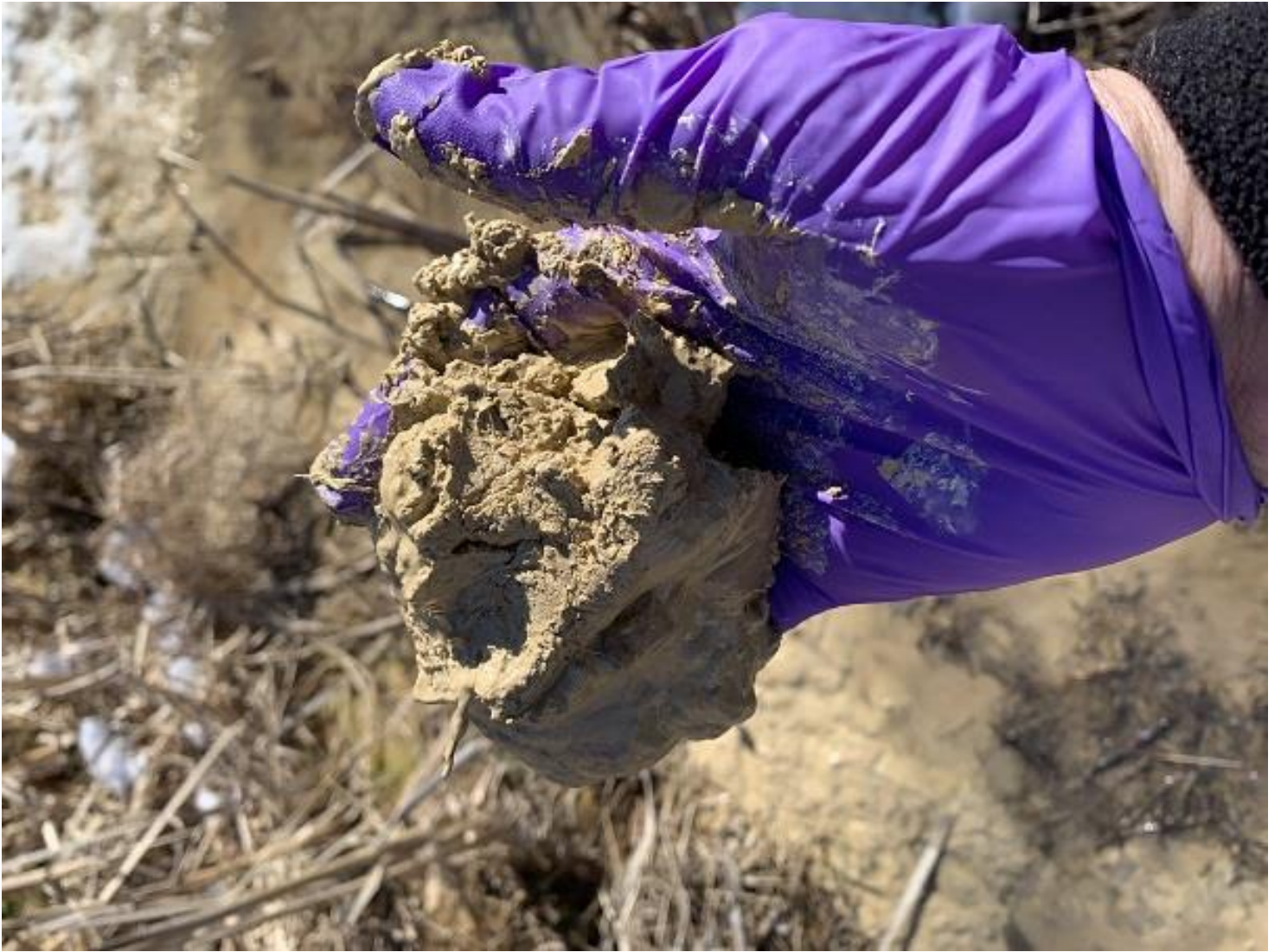
Material in wetland area