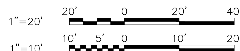
PLAN HORZ SCALE: 1"=20' VERT SCALE: 1"=10'