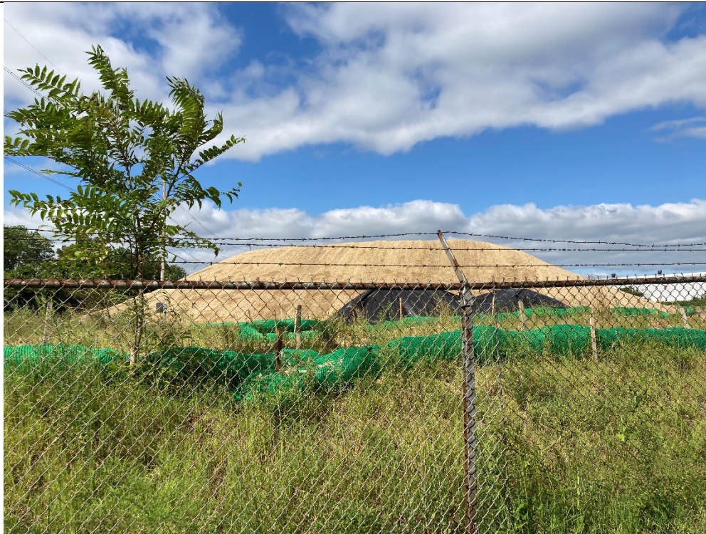
Downslope portion of site and fill dirt stockpile, taken from Bartram's Garden trail.