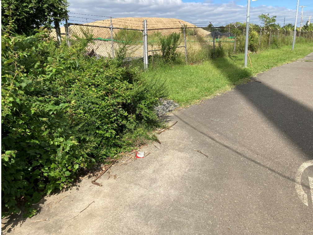
Sediment staining leaving site onto Bartram's Garden trail.