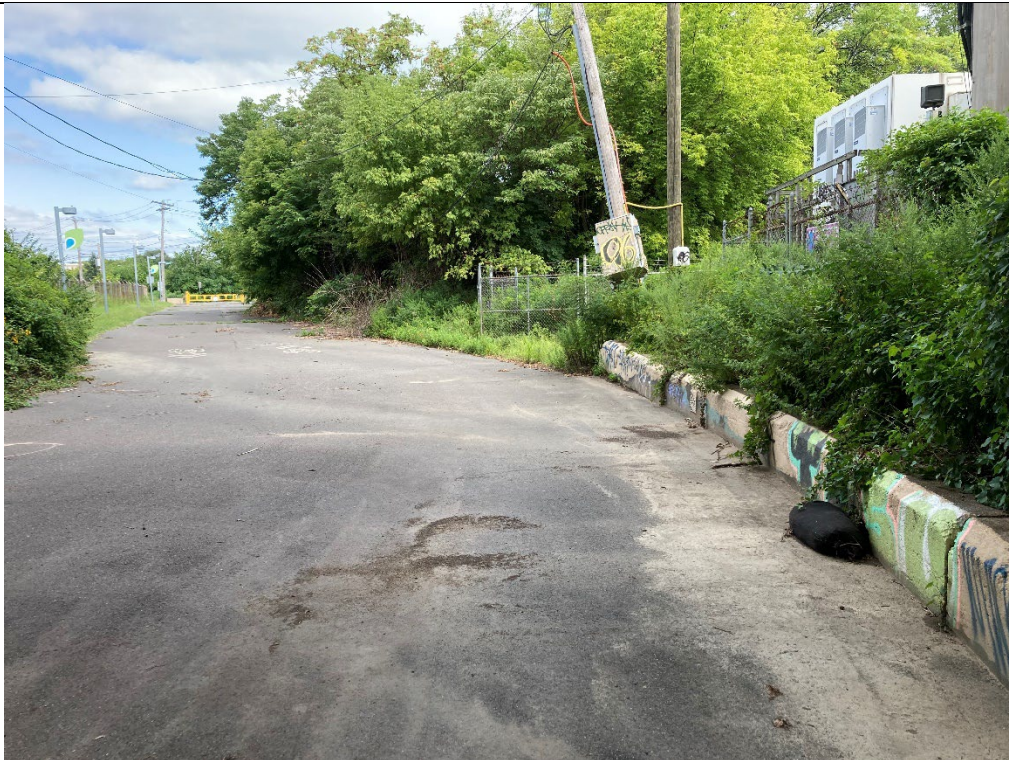
Sediment staining on Bartram's Garden trail.