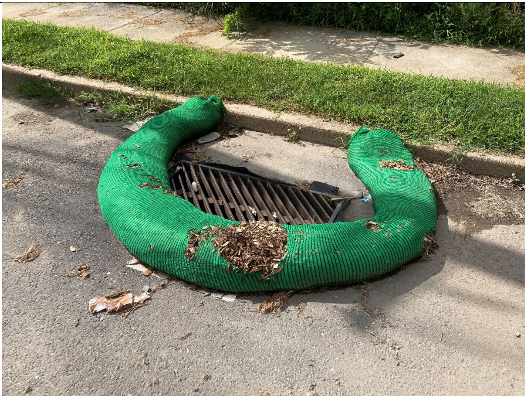
Inlet protection on 51 st St.