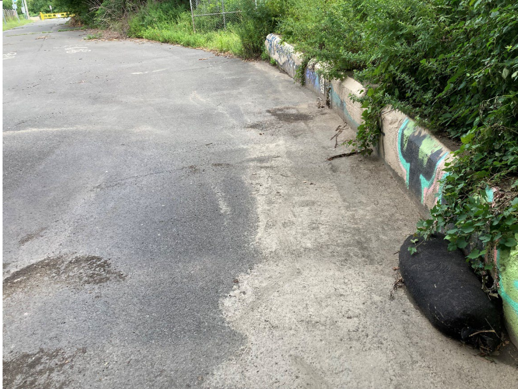
Sediment staining on Bartram's Garden trail.