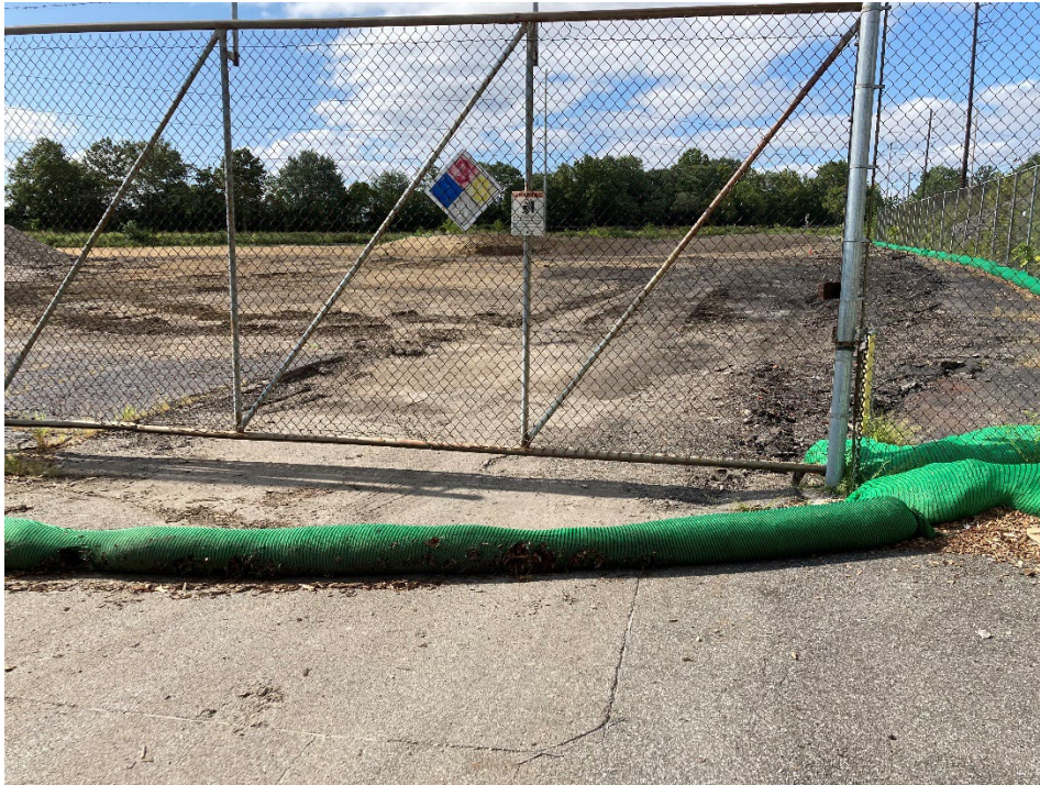
Filter sock, main gate, and upslope portion of site, along 51 st St.