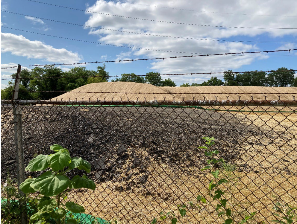
Mulched and rocky areas, with large fill dirt stockpile; taken from 51 st St.