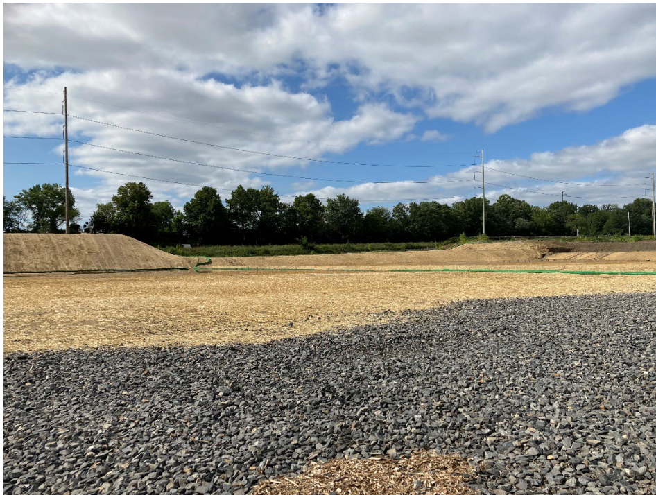
Mulched and rocked areas in middle portion of site. Upslope-most portion of large fill dirt stockpile at left.