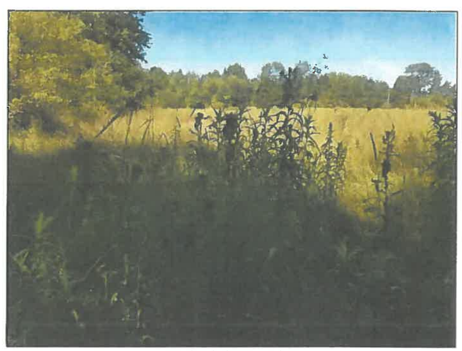
Wetland photograph 2