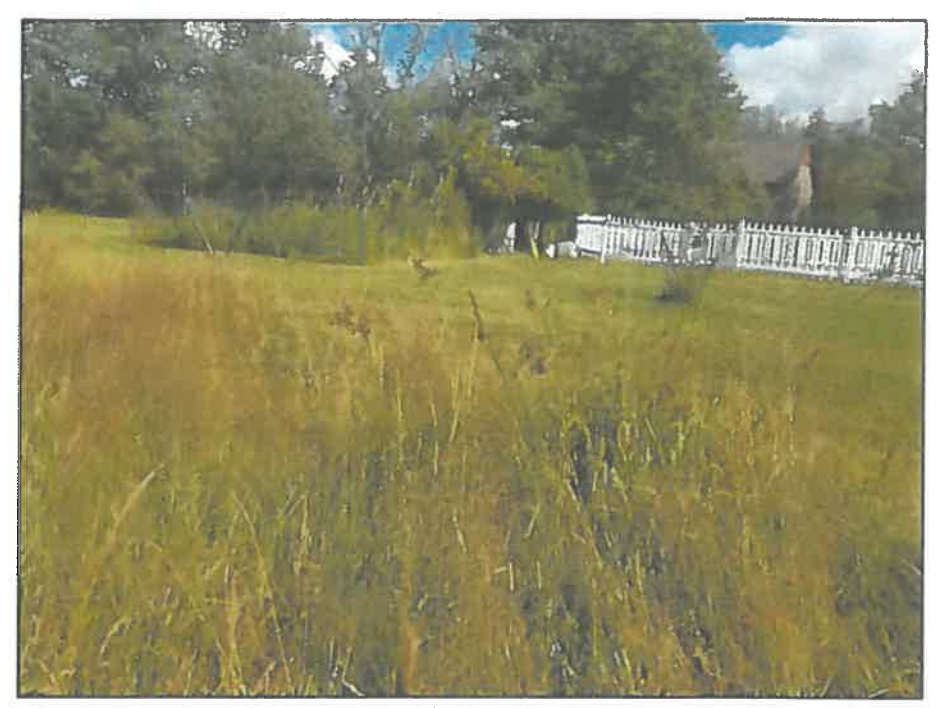
Wetland photograph 1