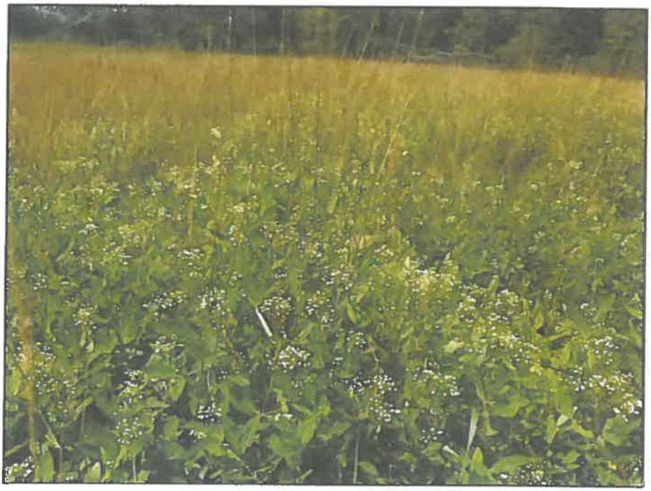
Upland photograph 2