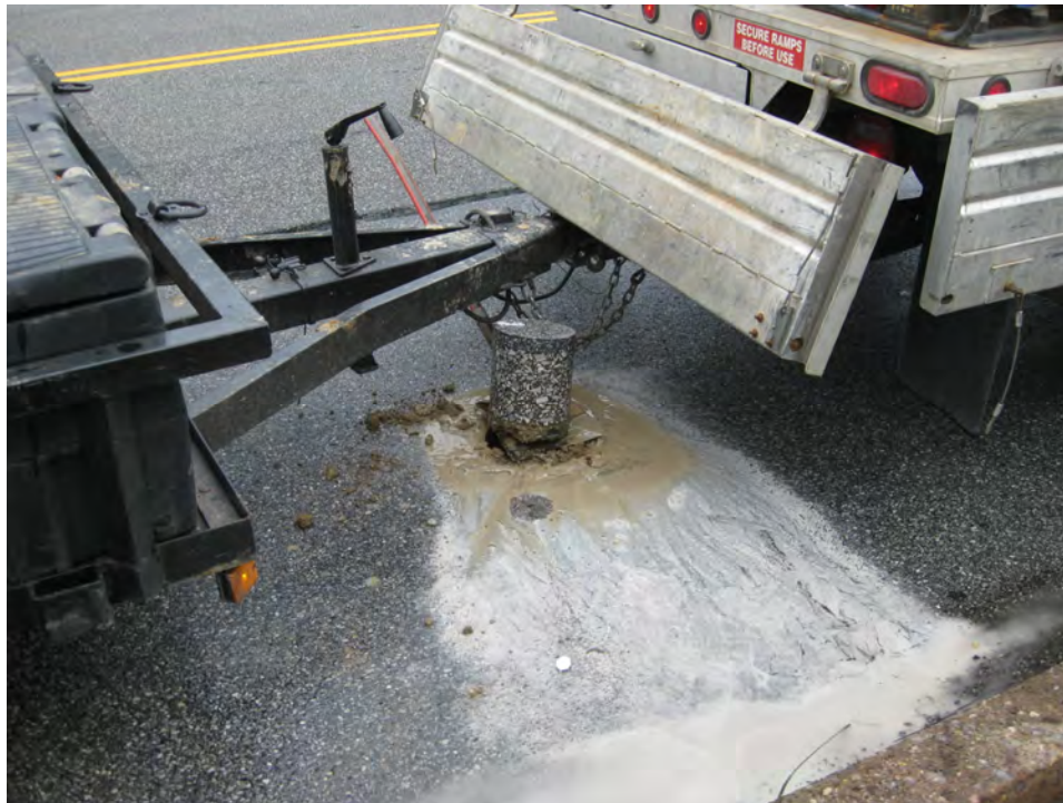
Asphalt pavement being cored in boring B-2.1 prior to drilling.

In addition to the split spoon samples, six shelly tube samples were taken in the following borings adjacent to the Sunoco facility in Lower Chichester Township: B-1.1, B-1.2, B-2.1, B-2.2, B-3.1, and B-3.2. These samples were not taken for the usual intended purpose of performing soil strength tests on undisturbed samples, but rather for acquiring larger samples on which to perform resistivity, corrosive, heavy metal, volatile organic compounds, and semi-volatile organic compounds testing if so desired.