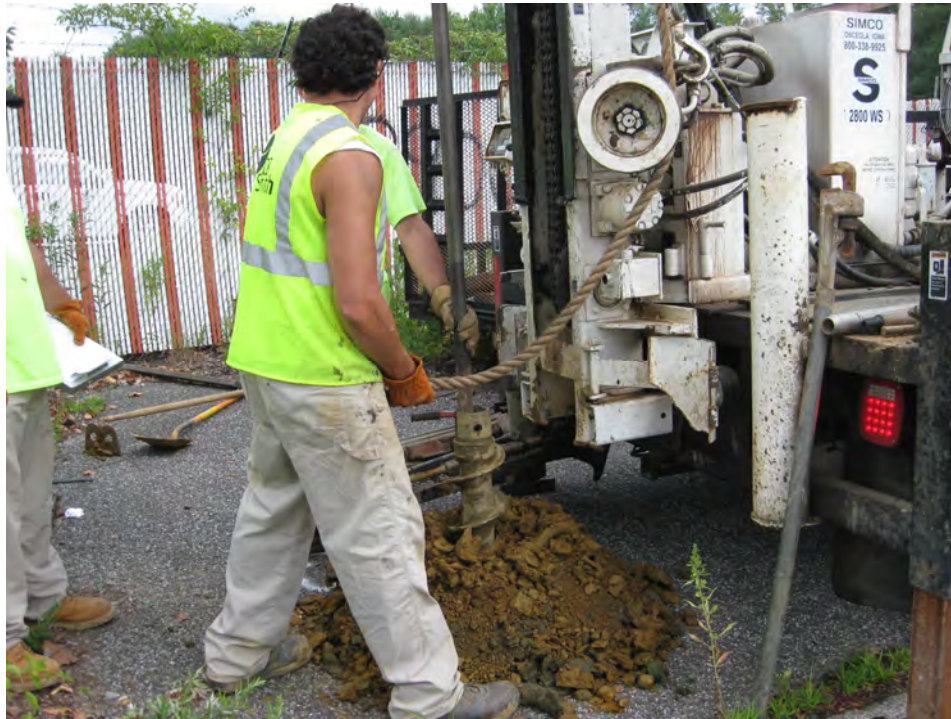
Drive Rod being lowered down through the hollow stem augers in order to obtain a standard penetration test sample in boring B-5.2.