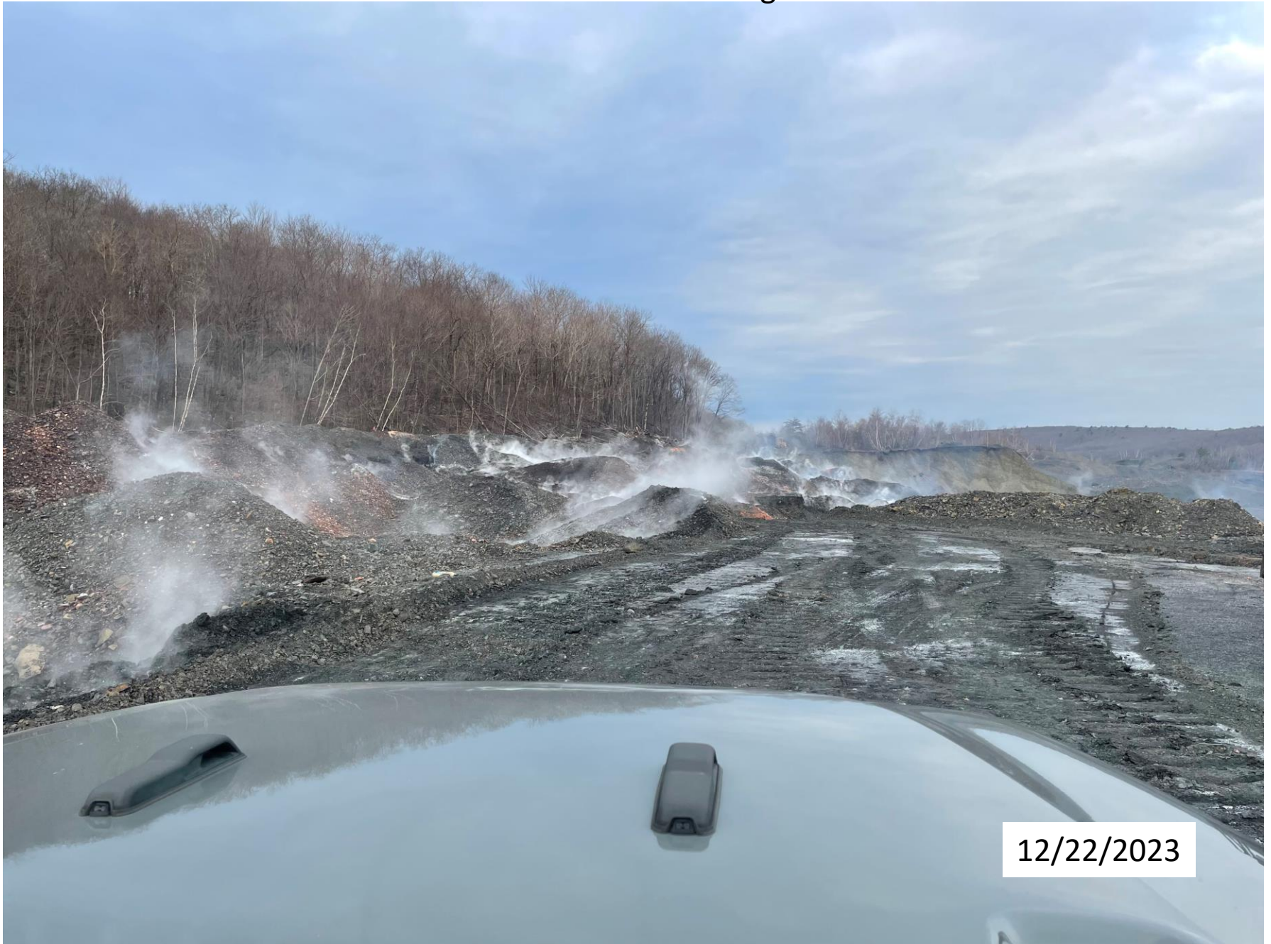
Photo of Fire Area Looking West