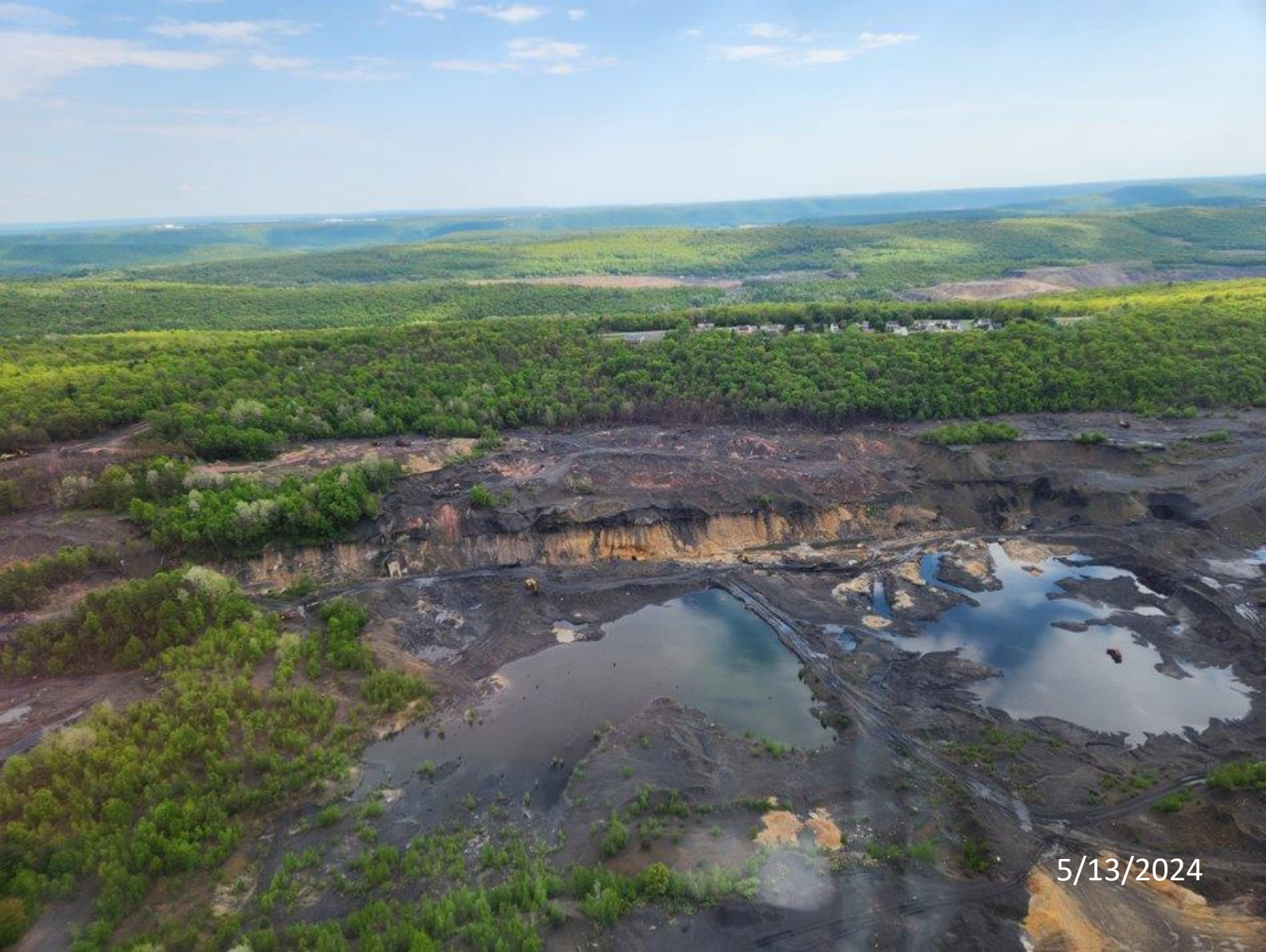
Air Photo of Fire Area Looking South