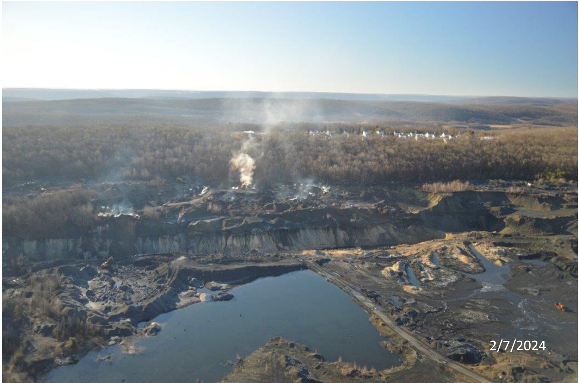
Air Photo of Fire Area Looking South