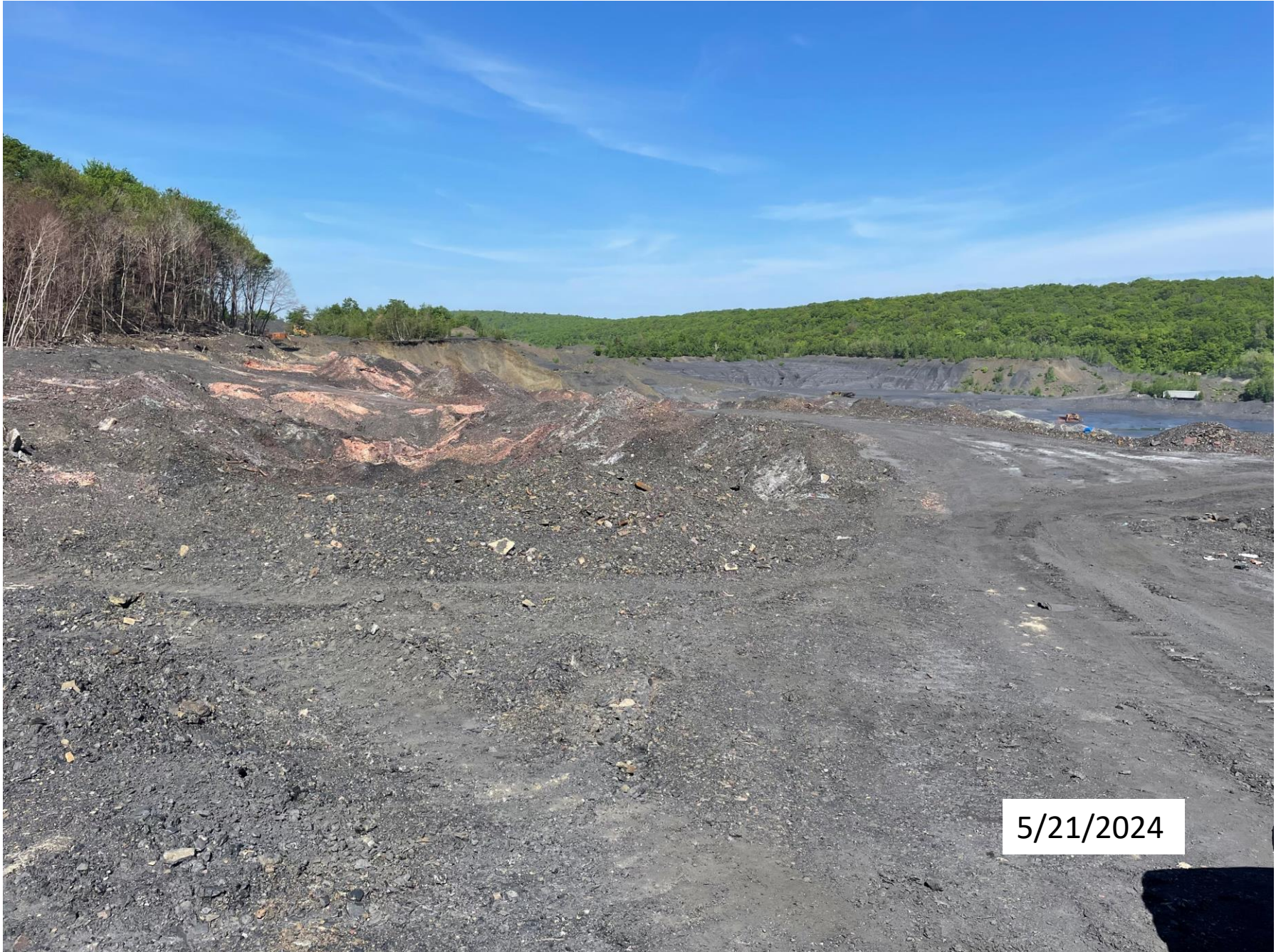
Photo of Fire Area Looking West