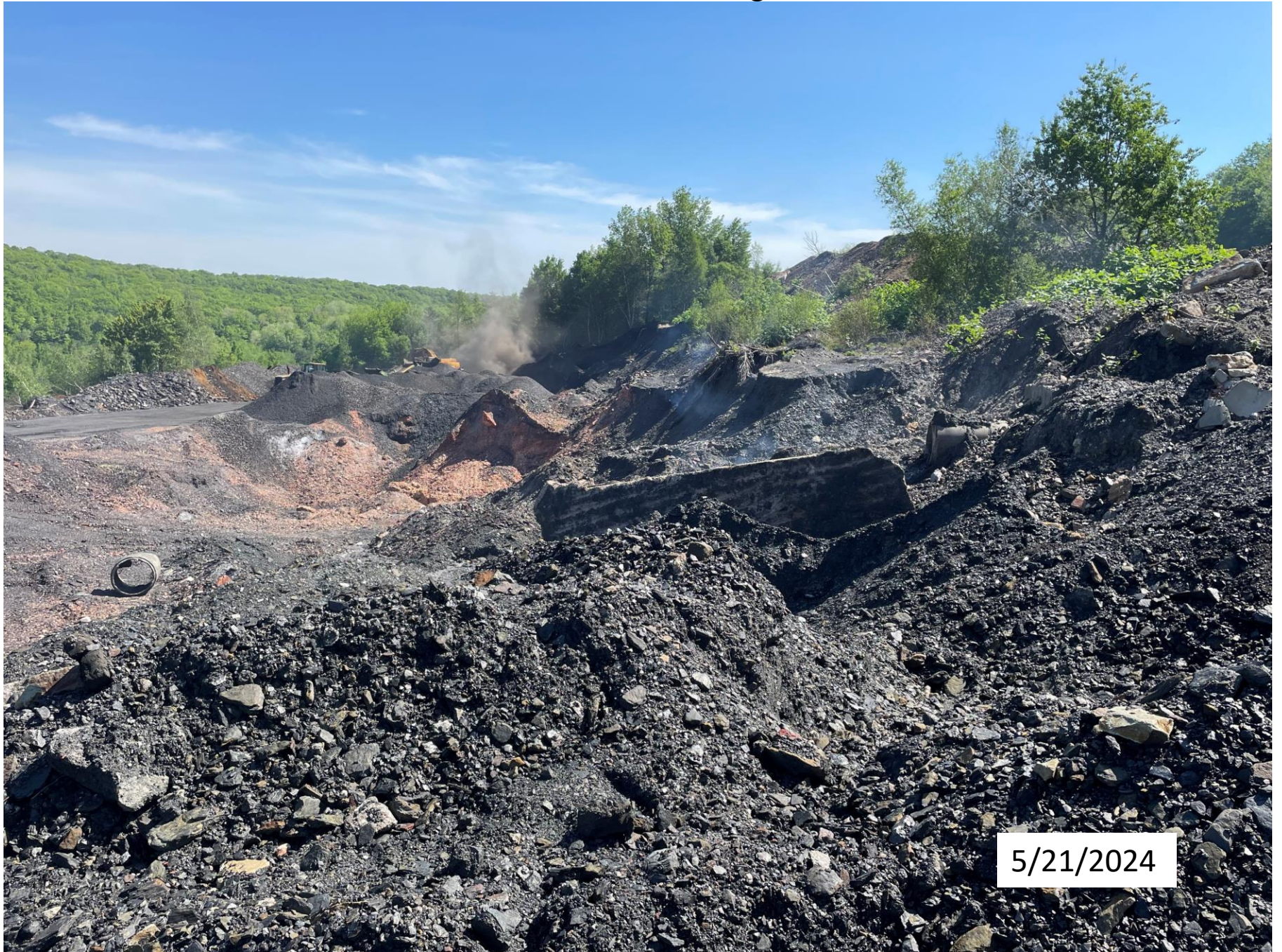
Photo of Fire Area Looking East