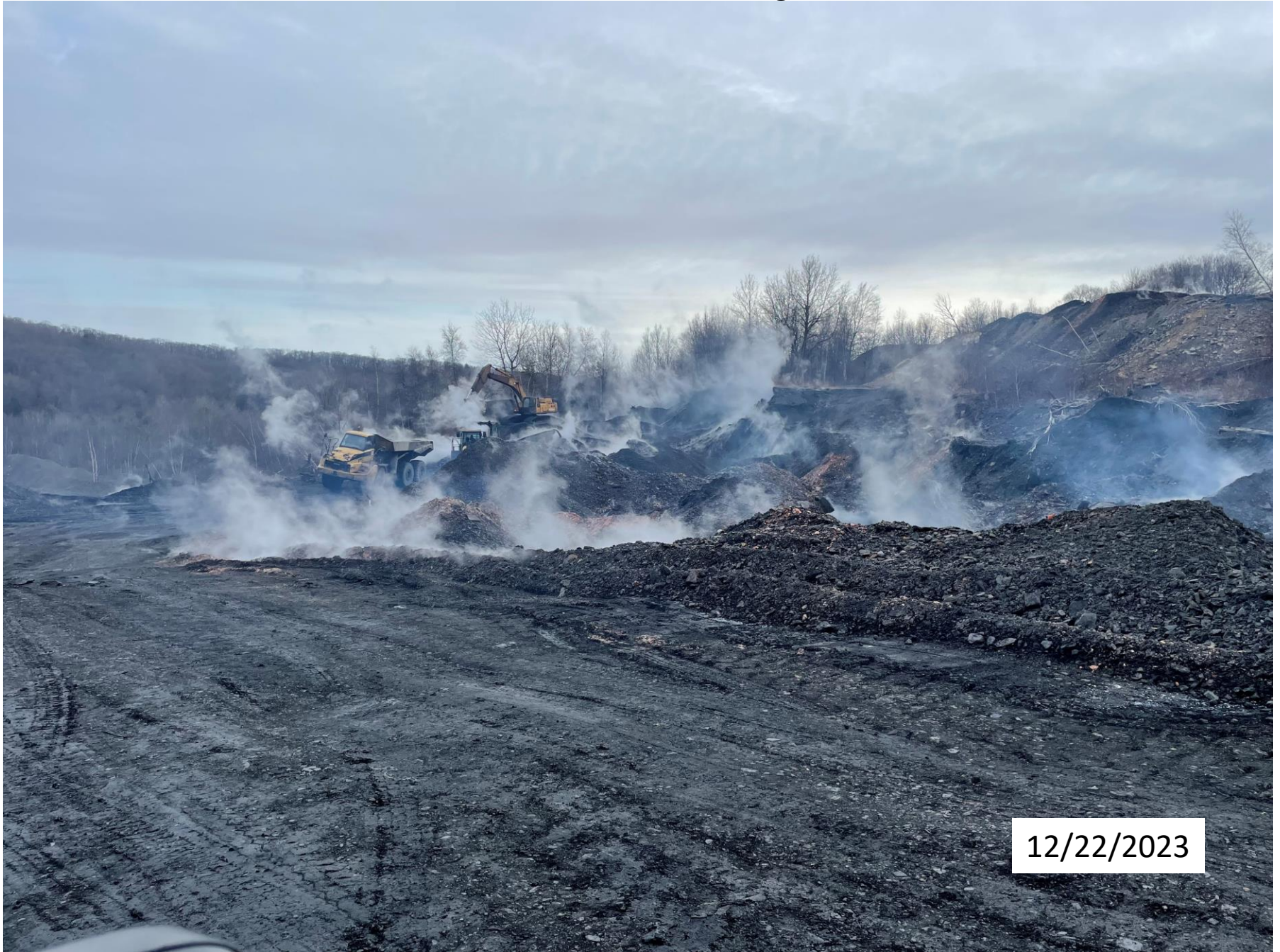
Photo of Fire Area Looking East