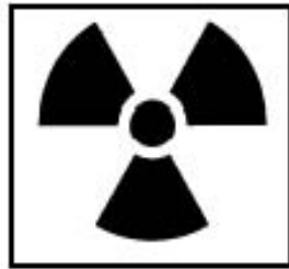
CAUTION RADIATION SYMBOL