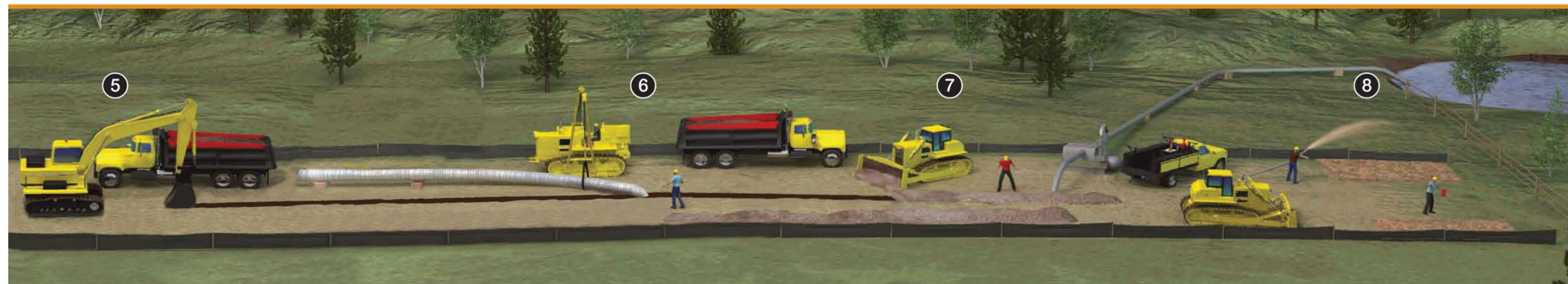
Figure 1.3-1 Typical Pipeline Construction Sequence

Williams' policy is to clean up and restore the work area as soon as possible. Disturbed areas are restored, as nearly as possible, to their original contours. Temporary environmental control measures are maintained until the area is restored, as closely as possible, to its original condition.