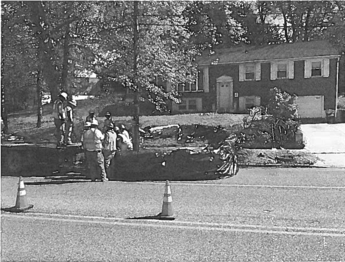
Containment around return area.

Christian M. Vlot | Water Pollution Biologist II Department of Environmental Protection | Waterways and Wetlands 2 East Main Street | Norristown, PA 19401 Phone: 484.250.5153 | Fax: 484.250.5971 www.depweb.state.pa.us