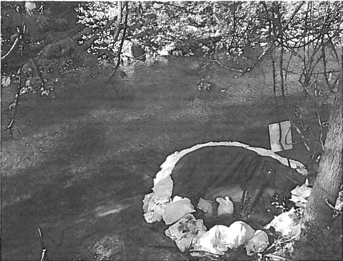
Outlet of STW inlet