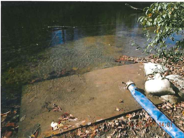
Clean Water Discharge from Upstream Pump to Chester Creek