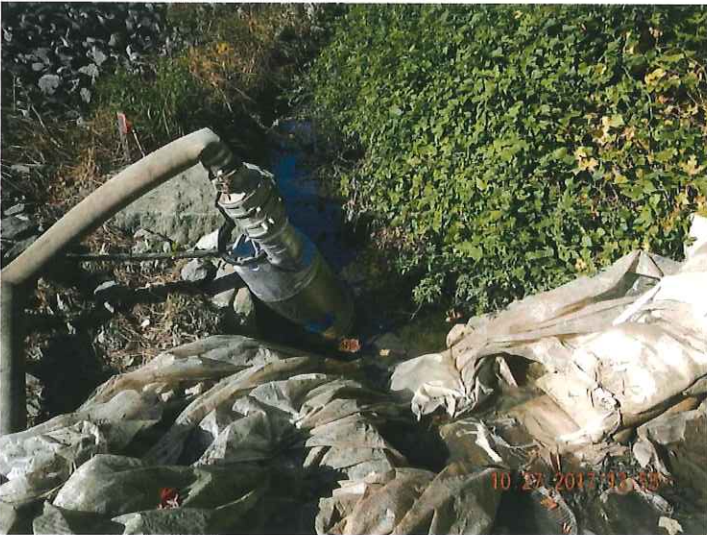
Upstream Dam with Pump