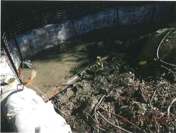
10-27-17 IR location