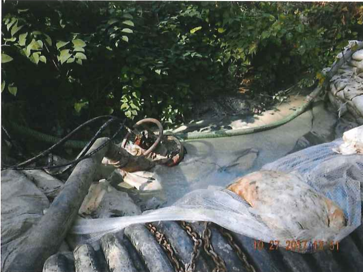
Contaminated Water Pumping Location