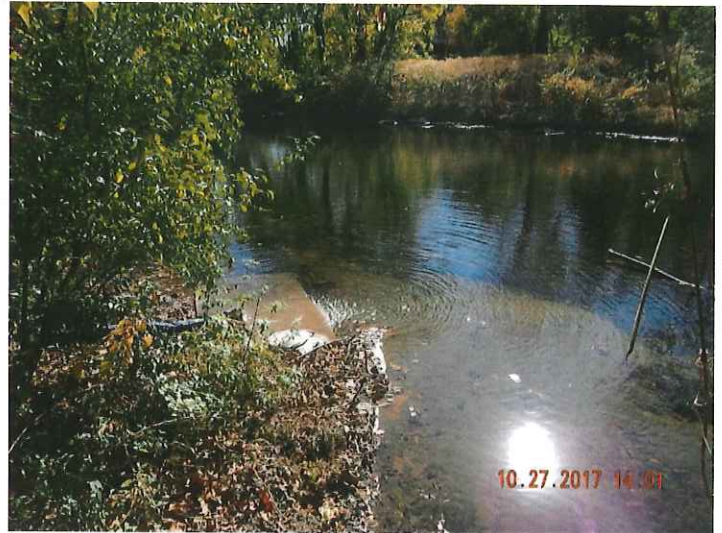
Confluence of Channel with Chester Creek