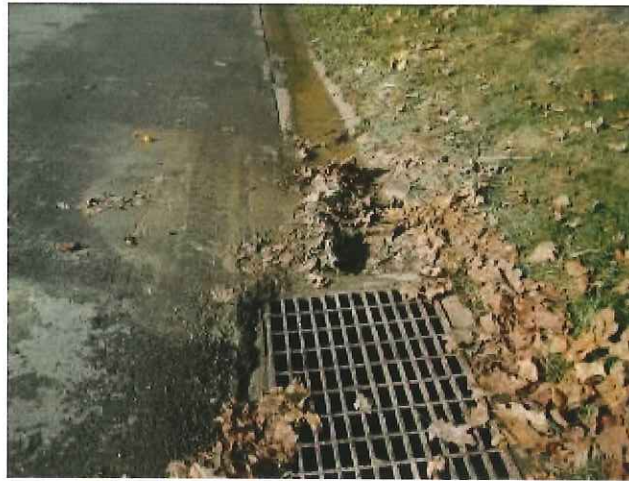
Storm inlet with drilling solution