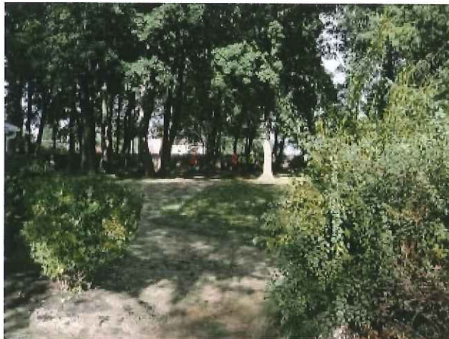
Flow path from discharge point to house