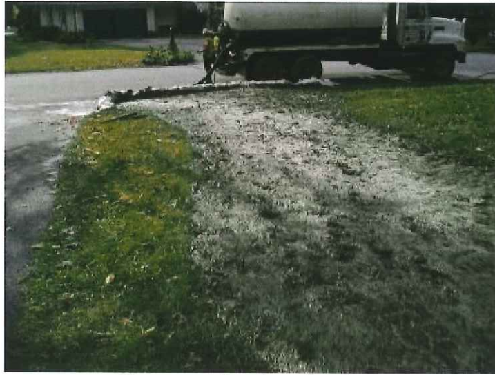
Vacuum truck and sandbag berm