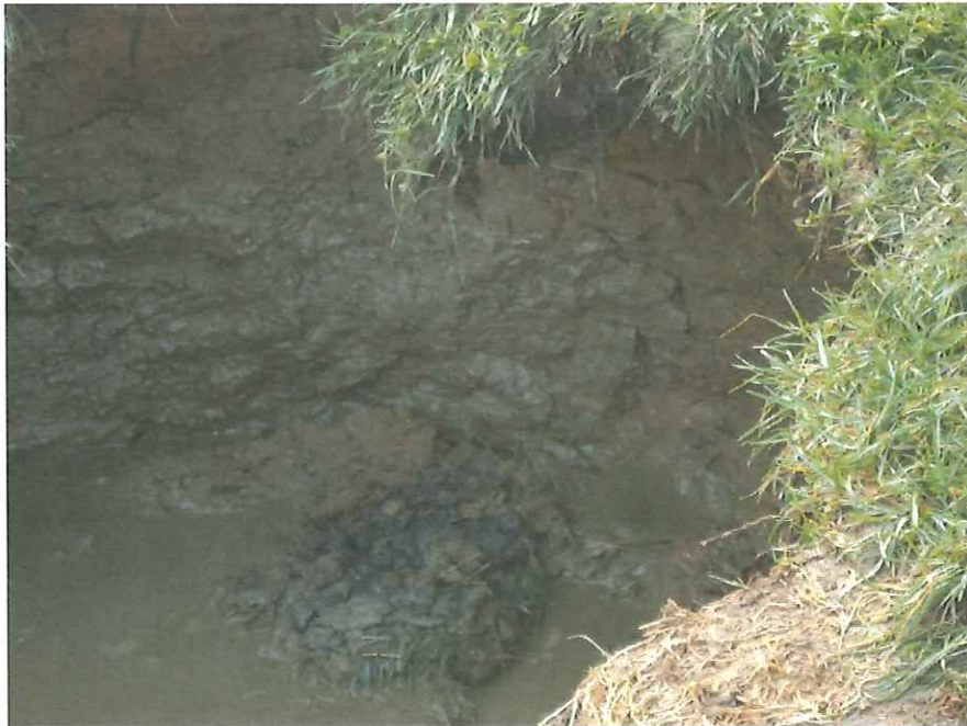
Close-up of the bottom of the hole