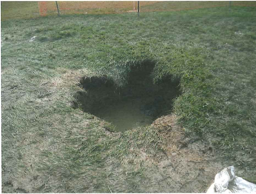
Close-up of the Hole