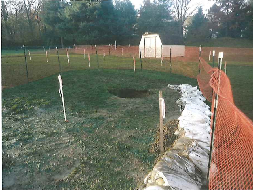
Subsidence hole and safety fence.