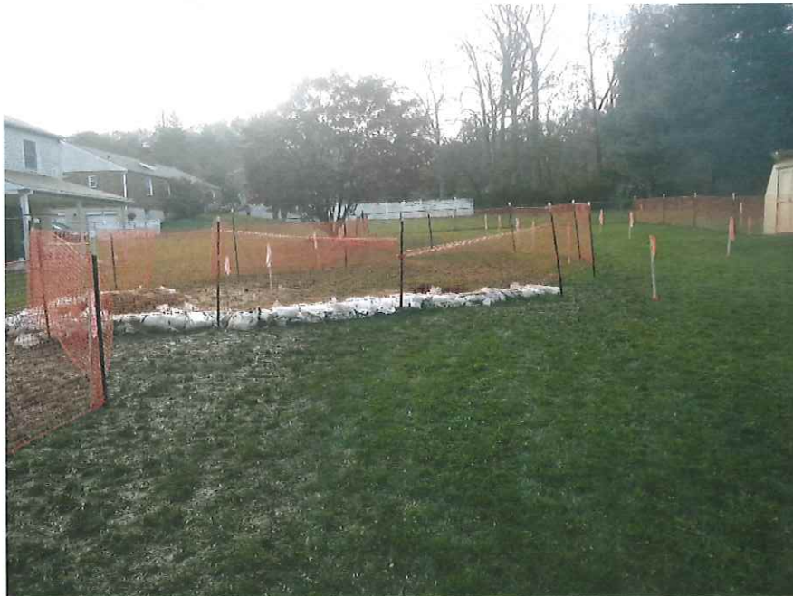
Flow path from discharge point