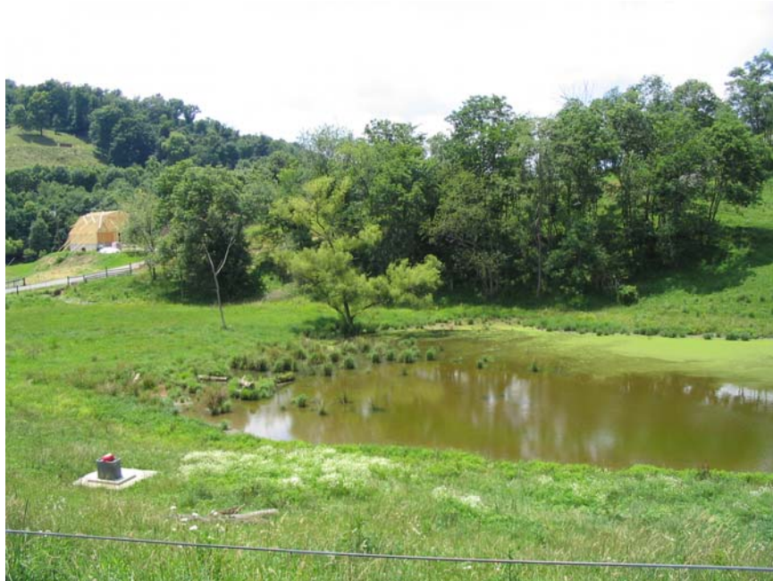
Figure VIII.1. A view of the pond as seen from the east. The wetland appears to have expanded after a recent rainfall to encroach on plants once located on its periphery.