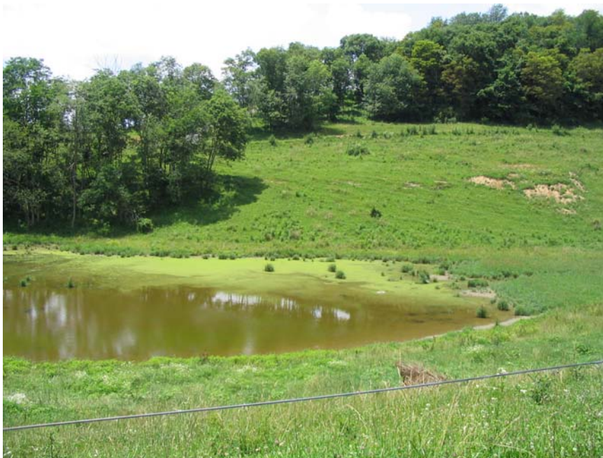
Figure VIII.2. The northern side of the pond in a view toward the west. This side of the wetland borders the southern boundary of Panel LW 47.