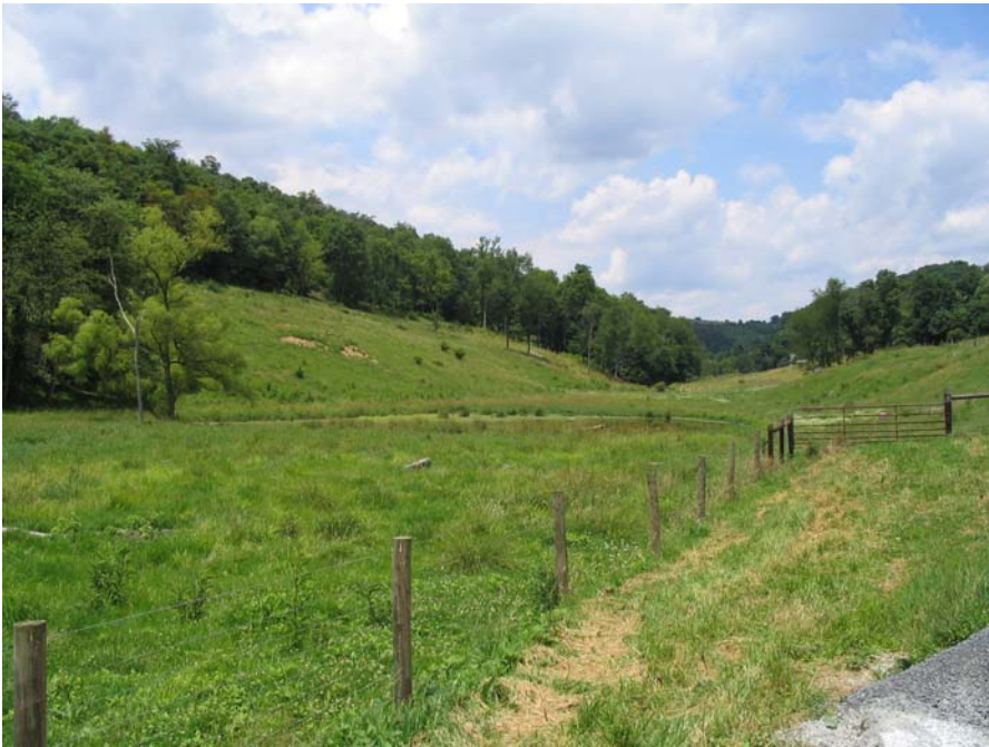
Figure VIII.4. The setting of the pond in a view taken from the road on the southern side of the wetland. This view looks from Panel LW 46 toward Panel LW 47.