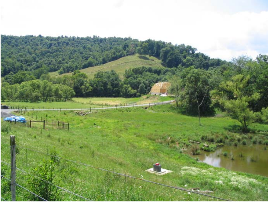
Figure VIII.3. The southern end of the freshwater pond in a view looking to the west. This end of the wetland overlies the northern boundary of Panel LW 46.