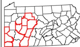
Study Area Counties