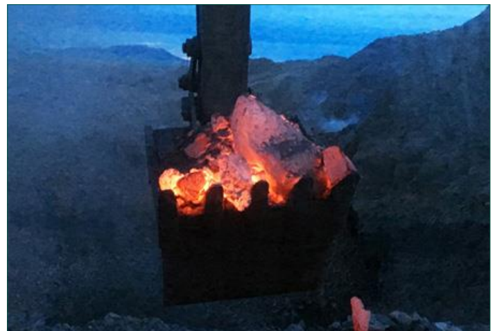
Colorado Department of Natural Resources Division of Reclamation, Mining and Safety