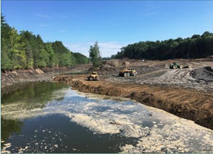
Watch a video about the Narrow Lake AML Site 1805

A dangerous and large highwall loomed above a road and a lake in the Greene-Sullivan State Forest, posing a danger to anyone driving, hiking, or fishing near Narrow Lake. Indiana's AML program worked with two sister agencies in the Indiana Department of Natural Resources to address the AML hazard. The collaborative effort removed almost 4,000 linear feet of highwall, and the agencies created additional cabin areas, built a new boat ramp, constructed more than a mile of trails, and added new fish habitat, all of which improved recreational opportunities at the site.