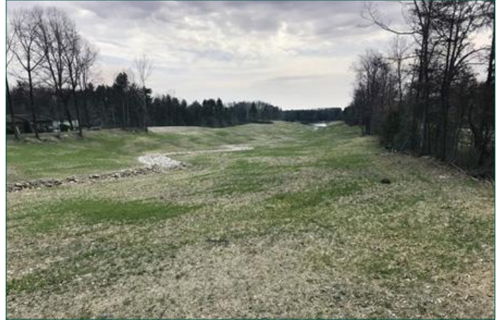
Indiana Department of Natural Resources Abandoned Mine Land Program