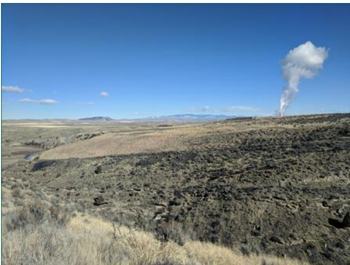
Watch a video about the Wise Hill Underground Mine Fire

One of the biggest underground mine fires in Colorado burned for more than 70 years, frustrating repeated efforts to contain or extinguish it. After several unsuccessful attempts to suffocate it, the fire migrated thousands of feet, grew in size, and threatened a nearby coal mine, and a town. The fire also generated toxic gases and heat that could have ignited surface vegetation, potentially leading to wildfires. Colorado's program used methods learned from a previous underground mine fire project to mitigate the threat and contain the fire deep underground, minimizing the danger of wildfire and toxic fumes.