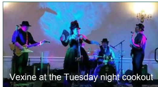
Vexine at the Tuesday night cookout