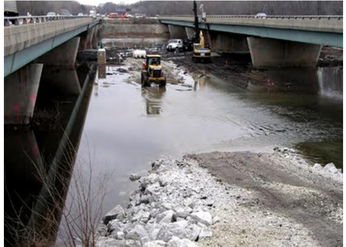
The twin 800-foot Interstate 72 bridges over the Sangamon River in Illinois.

In December, state AML officials began 24 hour monitoring of the bridges, collected data, and confirmed the suspicion that three ongoing mine subsidences - one at each end of the bridges and one in the middle - were causing land under the bridges to sag. They determined the cause of the subsidence were two underground room and pillar mines last operated in 1931 and 1951, about 200 feet down. In turn, the subsidence caused warping and damage to parts of the bridge pier supports. A state engineer warned that because of their unique design characteristics, the bridges could not handle uneven sagging from the sinking ground, and said failing to act could lead to the loss of one or both bridges, and of human life. The state moved quickly to address those threats.