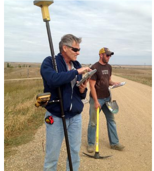
AML using GIS on the iPad in the field.

AML is currently using iPads on a drilling and grouting project near Beulah, ND. Holes were drilled along the road and ditch the previous year and their locations recorded with GPS. The drill holes had been capped off, buried just below the surface and markers placed beside them with pink top stake chasers. These cased drill holes with voids were now being filled with grout in an attempt to stabilize this extensively undermined area. The iPad displays the map of these locations and gets within proximity of missing markers. Progress is tracked through data collection as voids are filled with grout.