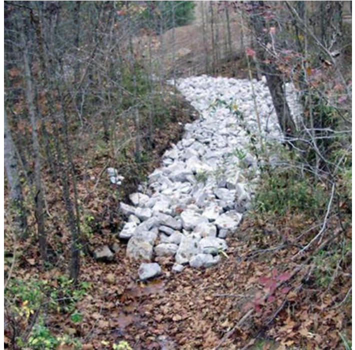
An example of the limestone channels created to help increase PH levels in the watershed.

The results speak for themselves. At Robert's Hollow, average PH rose from 3.1 to 5.8 after the project was completed. The change is mirrored at White Oak Creek, Paint Cliff and Lower Rock Creek. Through the entire system, the project reduced the monthly acidic load in the water by 99%. As a result, fish and other aquatic life and land-borne animals have returned to lower Rock Creek and White Oak Creek.