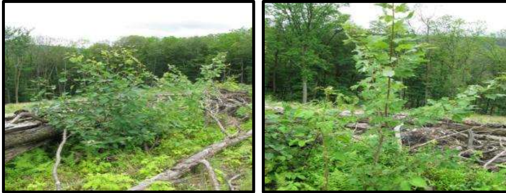
Figure 9: Seven-Foot Aspen and Maple in Brush Barriers at Newtown

Hay mulch was used at Newtown, as opposed to straw at the Branchdale project, perhaps the cause of more competing weeds/grasses at Newtown. The area surrounding the tree-seed plots was seeded with a broadcast cone spreader, as opposed to a hydro-seeder used for surrounding areas at the Branchdale project, probably resulting in larger amounts of competing grass seed in Newtown tree-seed areas due to wind drift. Seeding was completed in spring with very wet conditions as opposed to the mid-winter, frozen ground conditions at the Branchdale project. This may account for some of the lesser tree growth and greater weed growth at Newtown. Several of the Newtown tree-seed areas have significant amounts of sweet fern and other weed growth.