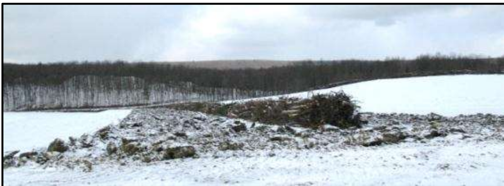
Figure 3: Branchdale Plot after Ripping – January 2009

The seeding was completed in the winter with very cold, frozen ground conditions. When the area was ripped by the dozer, large chunks of frost were displaced (Figure 3).