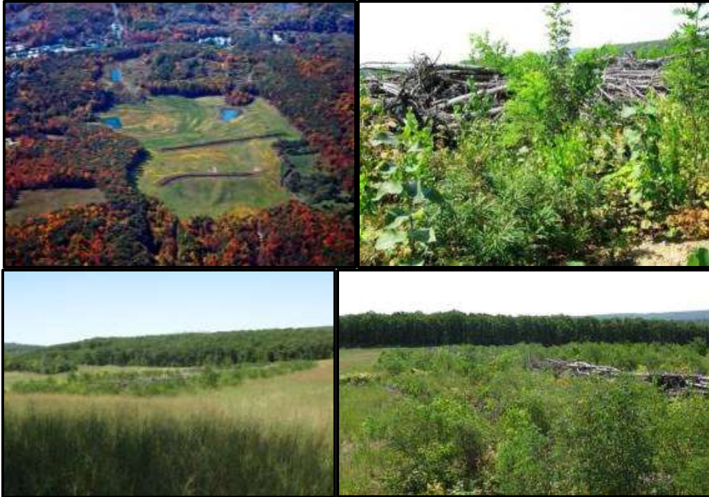
Figure 2: 2012 photos of Branchdale East Tree-Seed Plots

The seeding was completed in the winter with very cold, frozen ground conditions. When the area was ripped by the dozer, large chunks of frost were displaced (Figure 3).