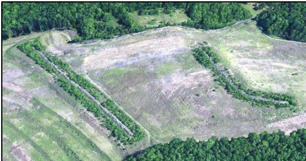
Figure 5: Aerial of Branchdale Tree-Seed Areas

In 2012, results showed that the seeded black locust, volunteer grey birch, aspen and catalpa from the corridor-linked wooded areas all had healthy populations. The two-year and three-year results of the tree plots at Branchdale encouraged further development, additional project designs, and implementation of more deep-till/tree-seed habitats in our rural projects.