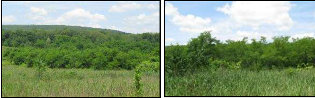
Figure 6: 2015 photos of Branchdale East Tree-Seed Plots