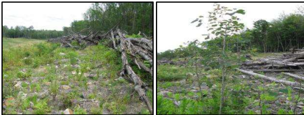
Figure 11: Tree-Seed Plots at Boyers Knob Lookout

Overall tree growth was successful in most tree-seed areas with brush barriers located on the slopes, with good variety and growth. Most of the lower/bottom-site tree-seed areas contained significant amounts of grasses and other weed growth constraining the variety and amount of tree growth found on the slope areas. The most prevalent species in the bottom areas were black locust and gray birch and speckled alder, but in lesser volumes than on the slopes.