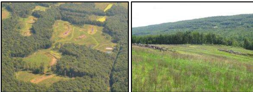
Figure 8: Tree-Seed Plots at Newtown

Deer browsing was notable on most species, heavy in spots, resulting in growth stunting. Note that in Figure 7, the tallest sumac observed in 2015 was a foot shorter than those observed in 2014. In April 2015, twenty chestnut tree saplings were planted at one of the tree-seed plots at Newtown, protected by tree-tubes. Tops of the chestnuts were browsed off as they emerged from the tree tubes. It is evident that the brush barriers provide protection from deer browsing as evidenced by taller trees (Red Maple, aspen and Scarlet Oak) growing within the brush.