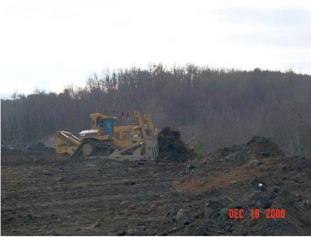
Figure 9: Contractor grading site with a Cat-D11 dozer.