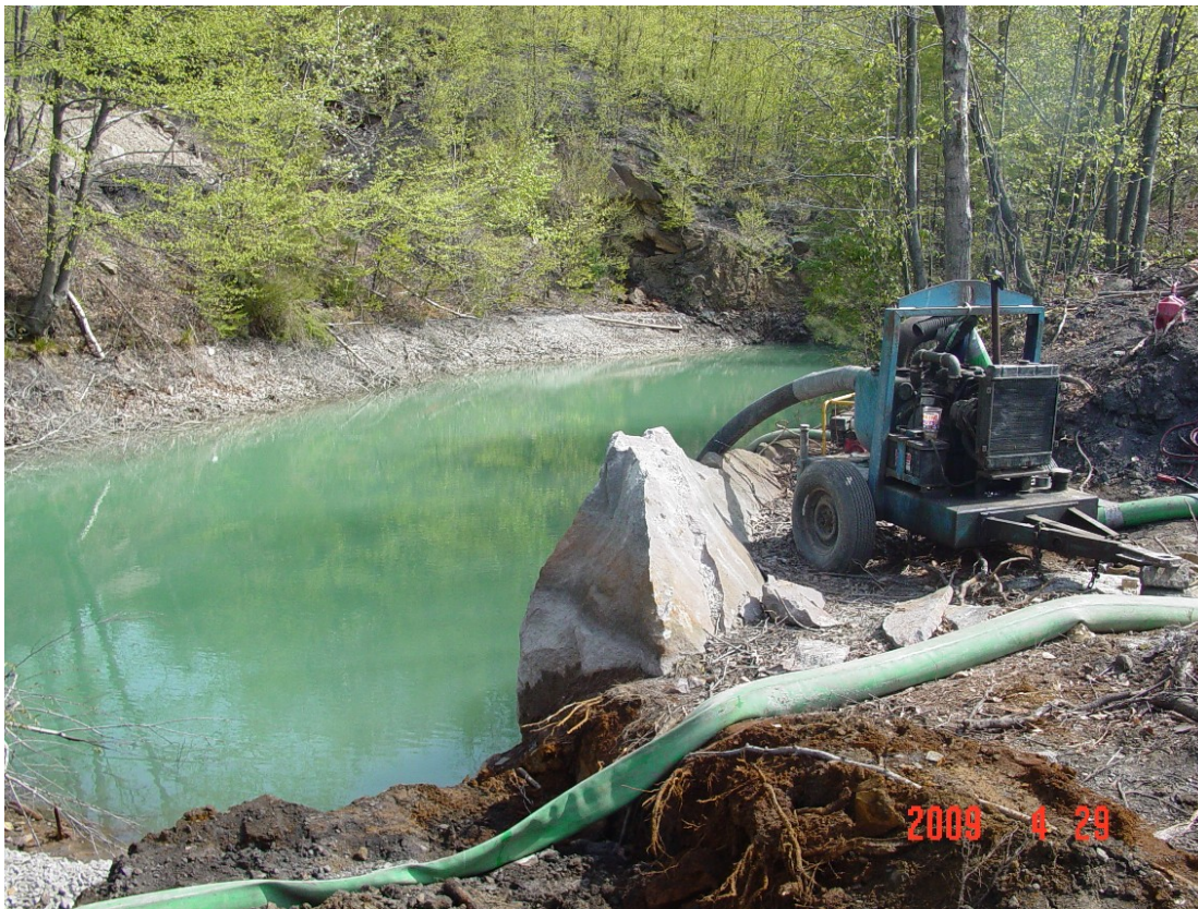
Figure 8: The pumping of the water-filled pit.