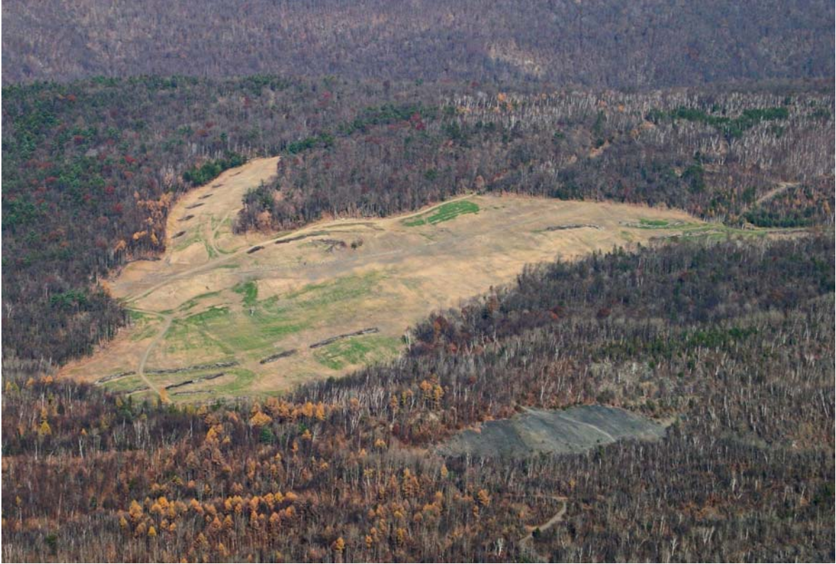
Figure 11: An aerial view of the Newport North project shortly after completion.