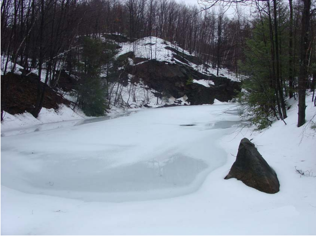
Figure 5: The water-filled pit frozen and snow covered.