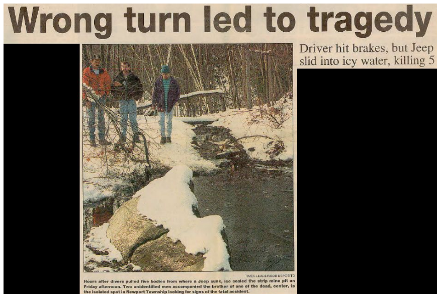
Figure 3: The (Wilkes Barre) Times Leader newspaper headlines of the two tragedies.

Unfortunately, on April 26, 2004 the same small pit was once again the site of a second tragedy. A truck carrying two individuals traveled to the same remote area late at night. Similar to the first incident, the driver of the truck mistakenly drove off the dirt road over a small highwall into the water-filled pit and sank. The driver was able to escape from the vehicle; however, the passenger never surfaced. It took the survivor over three hours to make the trek out of the woods and seek help. It was daylight before rescuers reached the scene of the accident. The victim was a volunteer firefighter who many of the emergency responders knew and had worked along side. No longer could anyone view the first tragedy as just an isolated incident. This second occurrence heightened the need to reclaim this site.