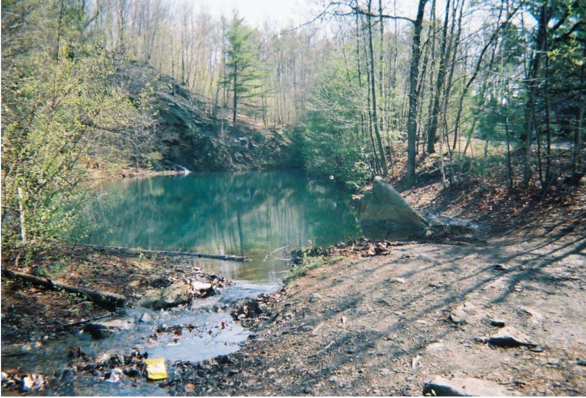
Figure 2: Water-filled pit that was the location of six fatalities.