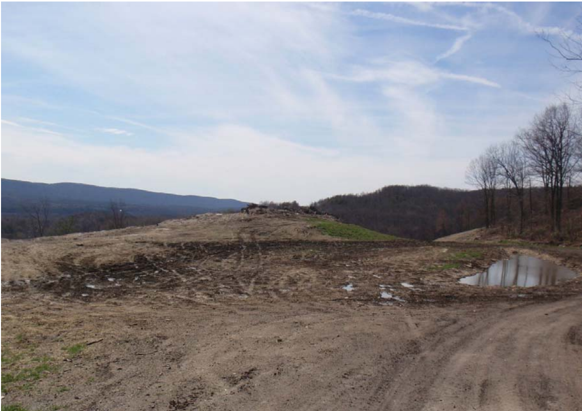
Figure 12: The mud bogging area trespassers created.