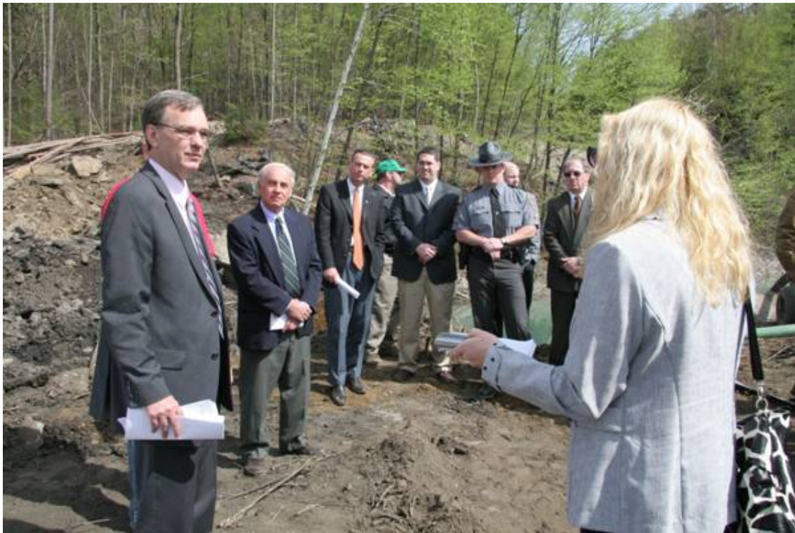
Figure 4: Attendees of the Stay Out-Stay Alive event that occurred at the site.