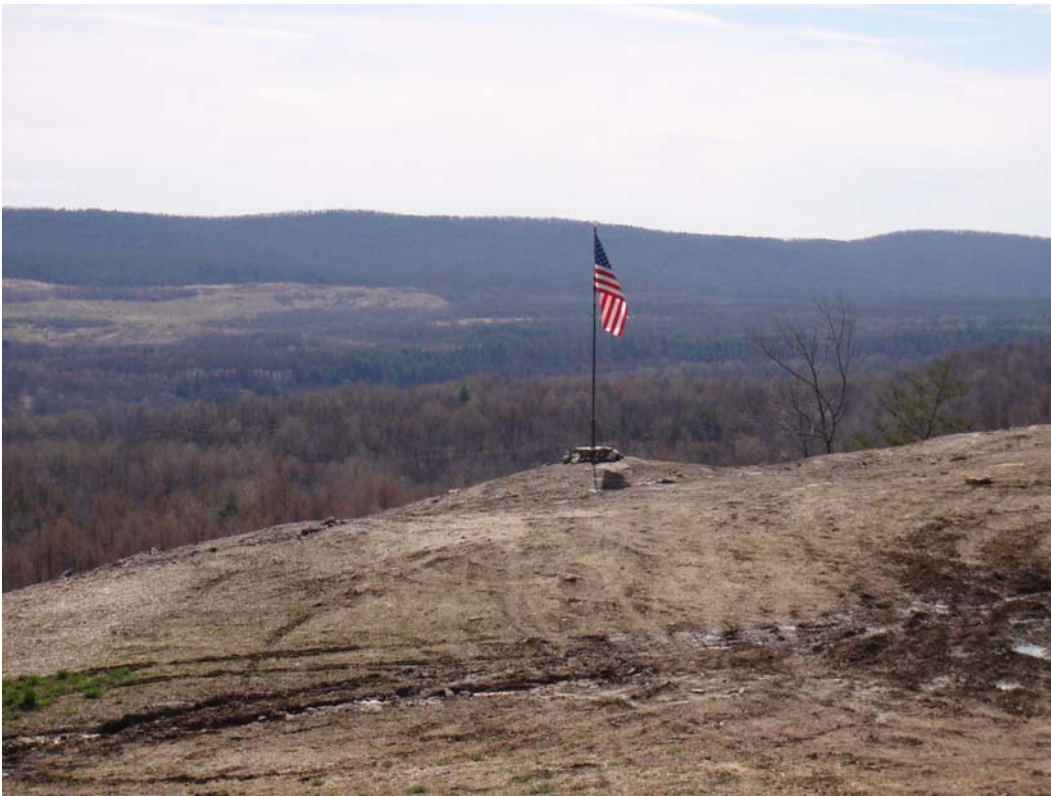
Figure 10: Shortly after reclamation, the trespassers erected a flagpole.