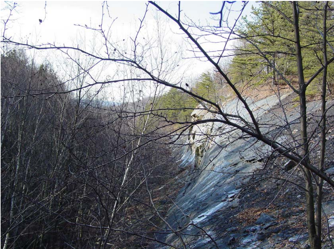
Figure 6: Near-vertical highwall of a stripping pit at the Newport North site.