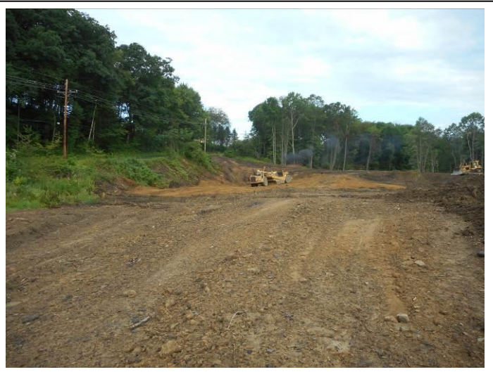
Installing the three 36-inch pipes under the utilities.