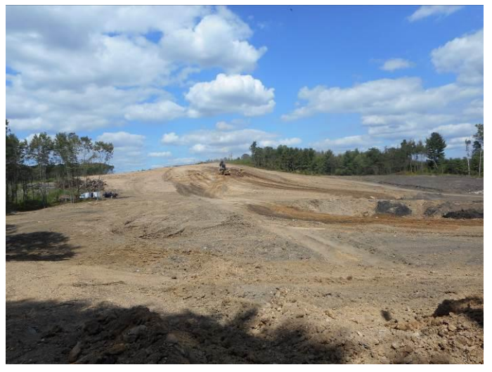
Installing block erosion control matting through the park.