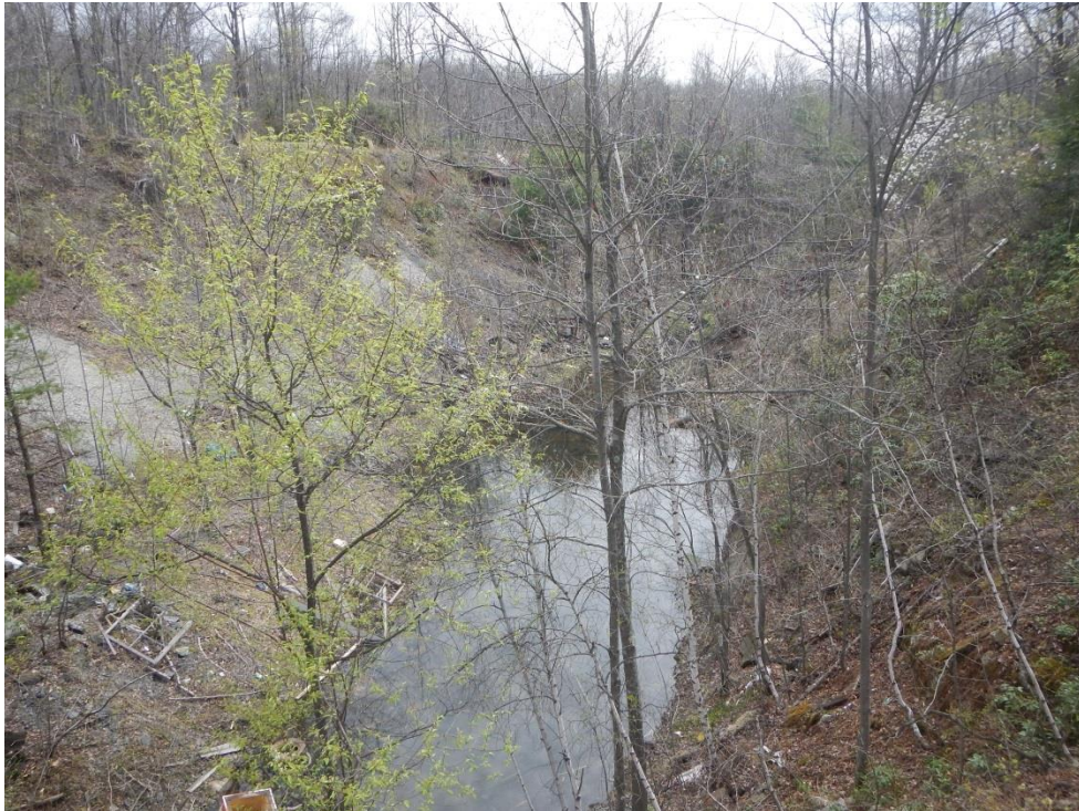
Pit with Dangerous Highwalls