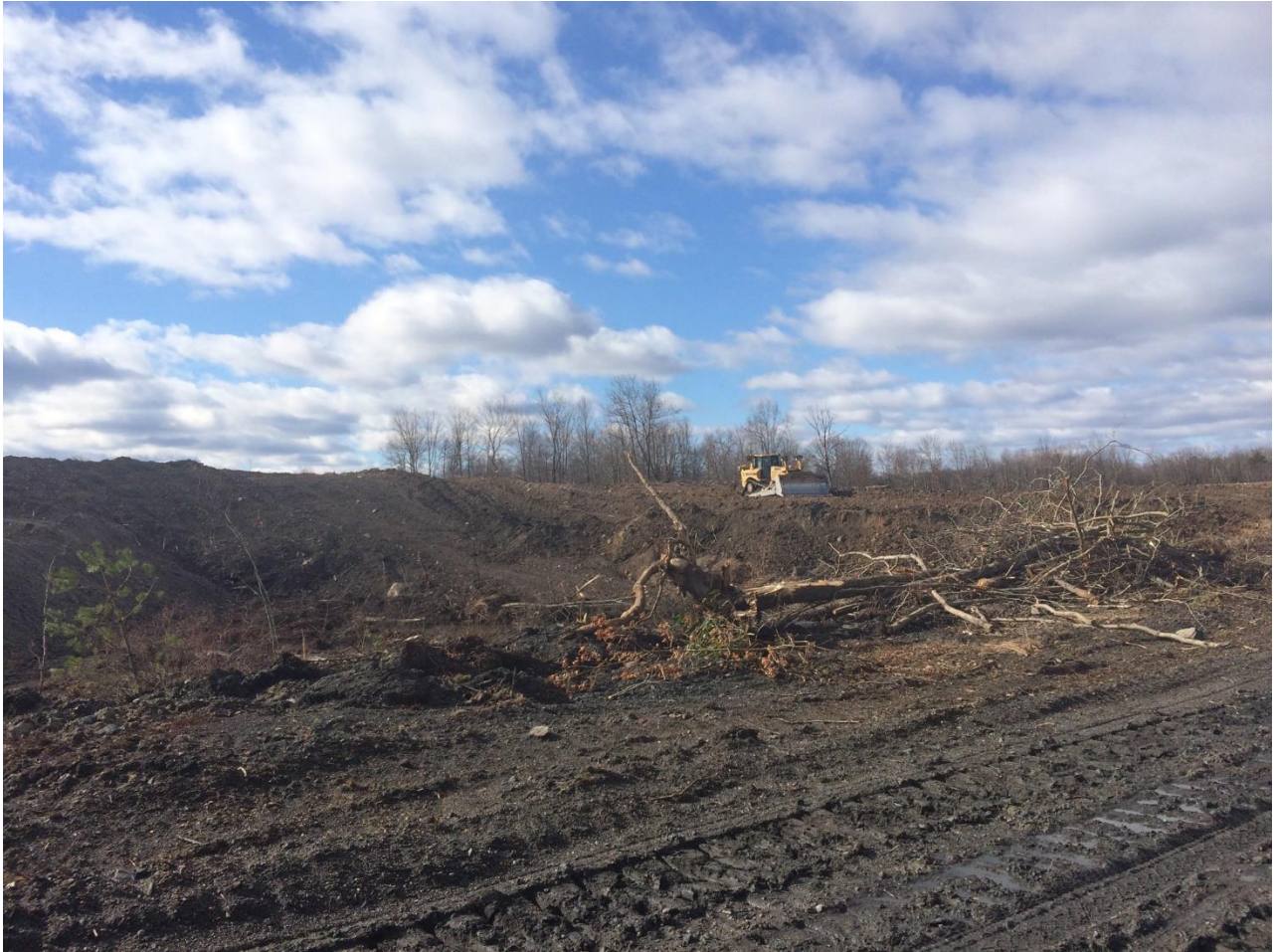
Grading south of proposed wetland