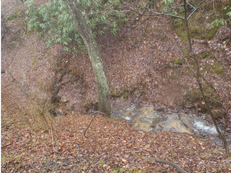
Existing stream to be reestablished to the surface