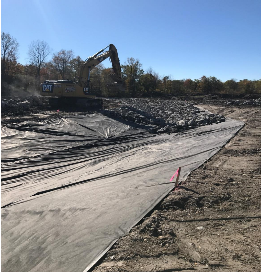
Rock Lining Ditch G