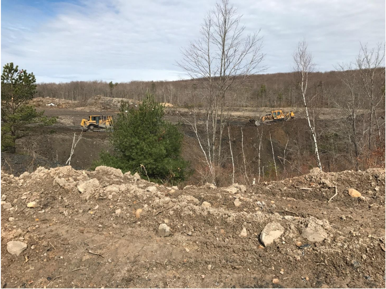
Pit being graded