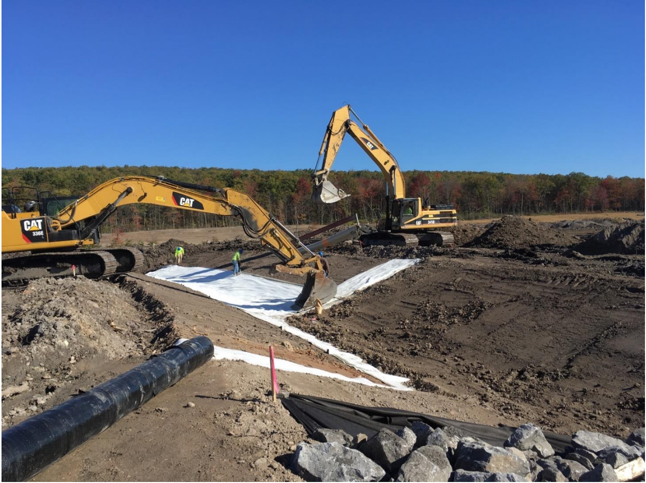
Installing Ditch G