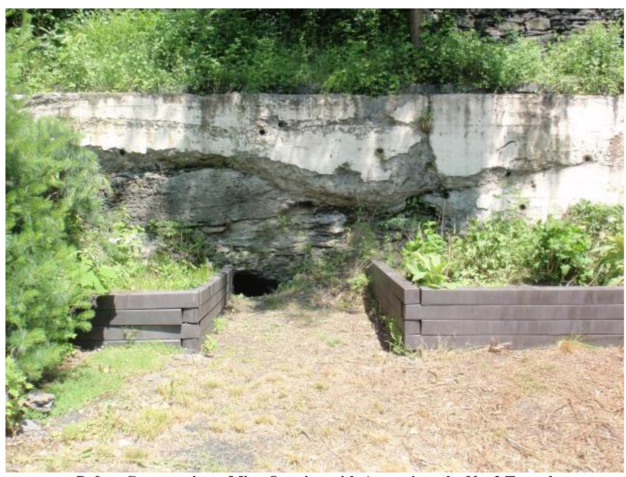
Before Construction – Mine Opening with Access into the No. 2 Tunnel