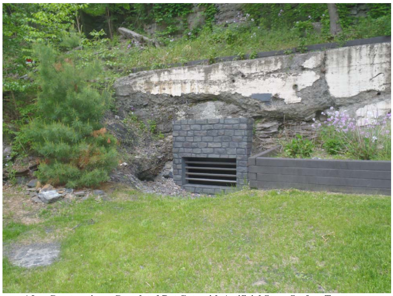
After Construction – Completed Bat Gate with Artificial Stone Surface Treatment