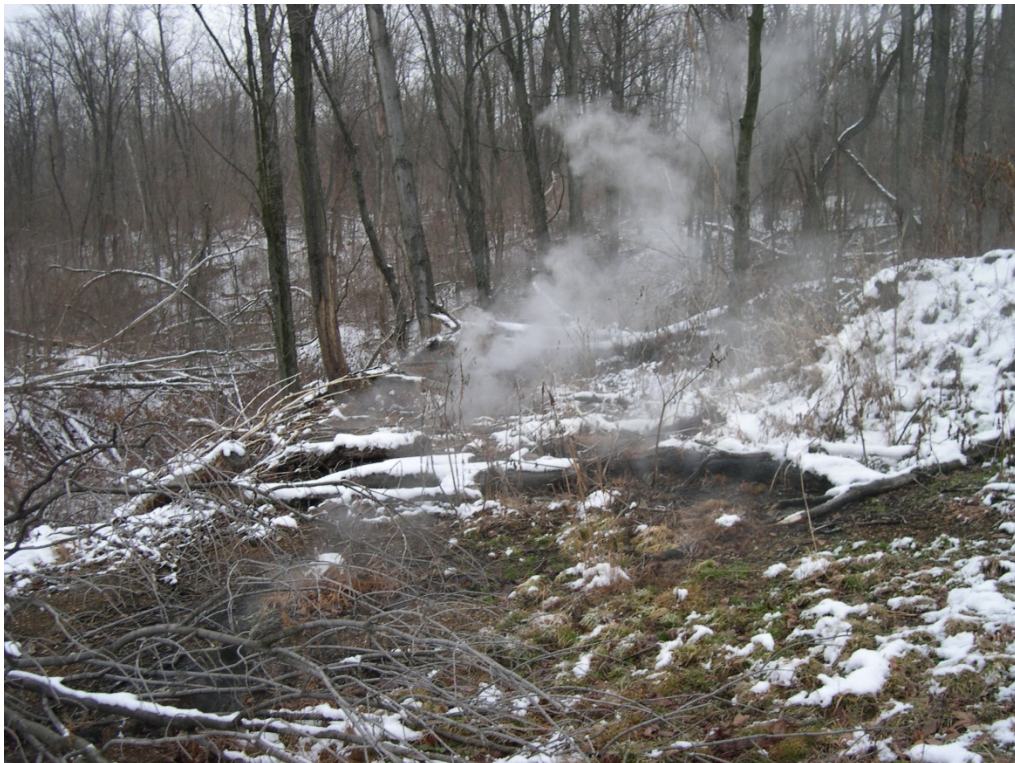
Steam and Smoke from the underground mine fire