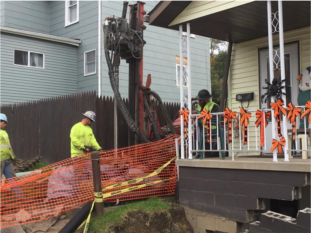
Drilling - Front of Home