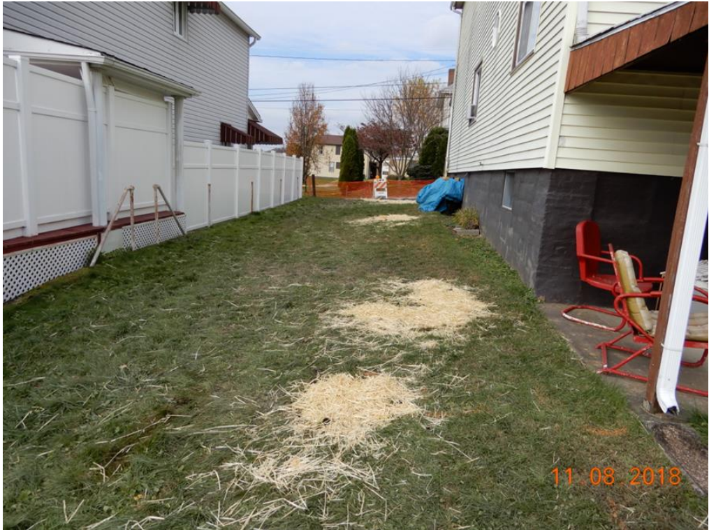
Side of Home