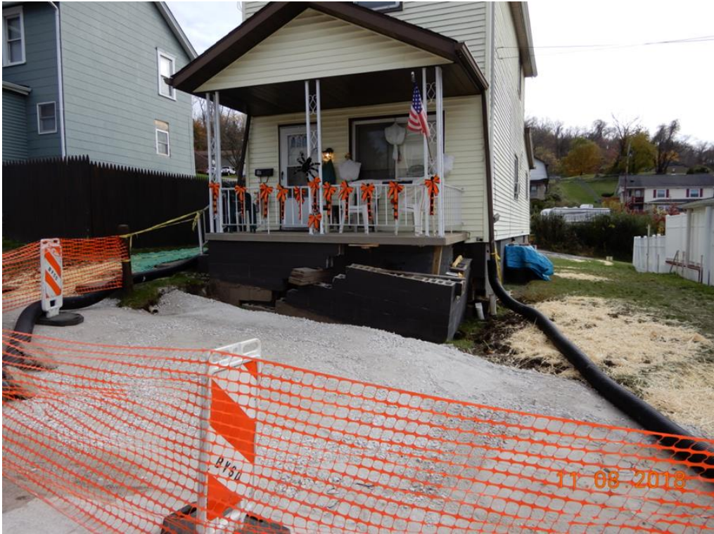
Front of Home