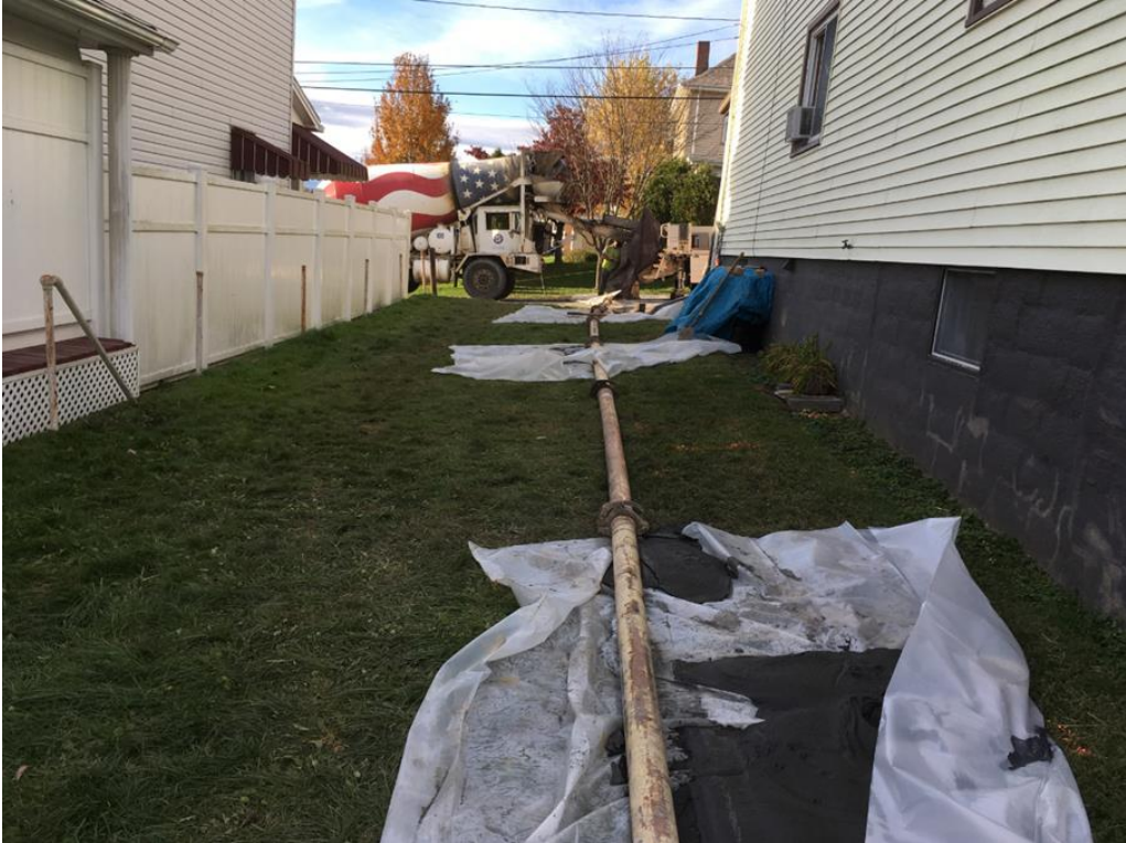
Grouting – Side of Home