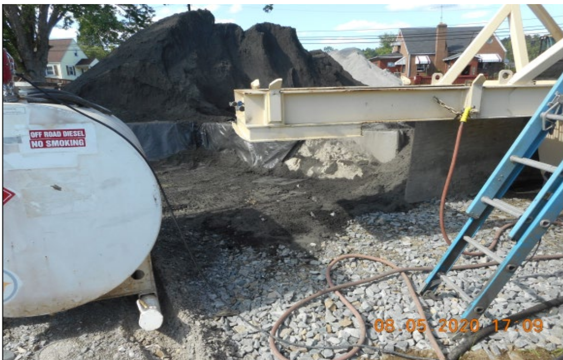
FAIRHOPE (MULTI-STRUCTURE SUBSIDENCE) CONTRACT NO. OSM 26(2757)102.1 EMER