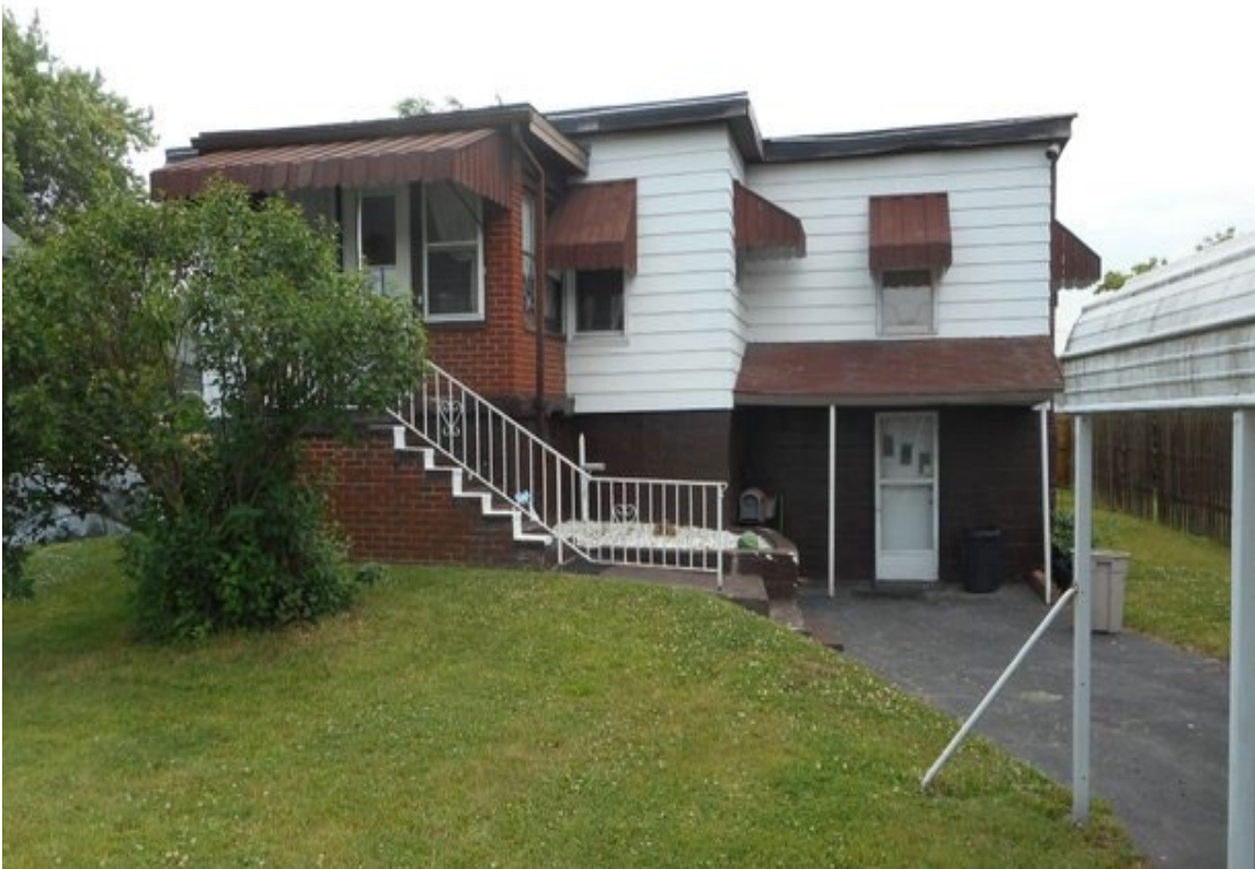
FAIRHOPE (MULTI-STRUCTURE SUBSIDENCE) CONTRACT NO. OSM 26(2757)102.1 EMER