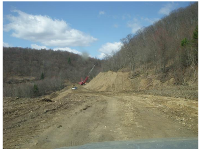
Some of the equipment used to set the grade.