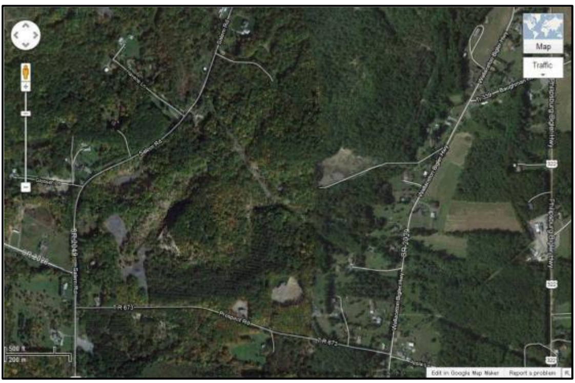
Site "B" Aerial Photo