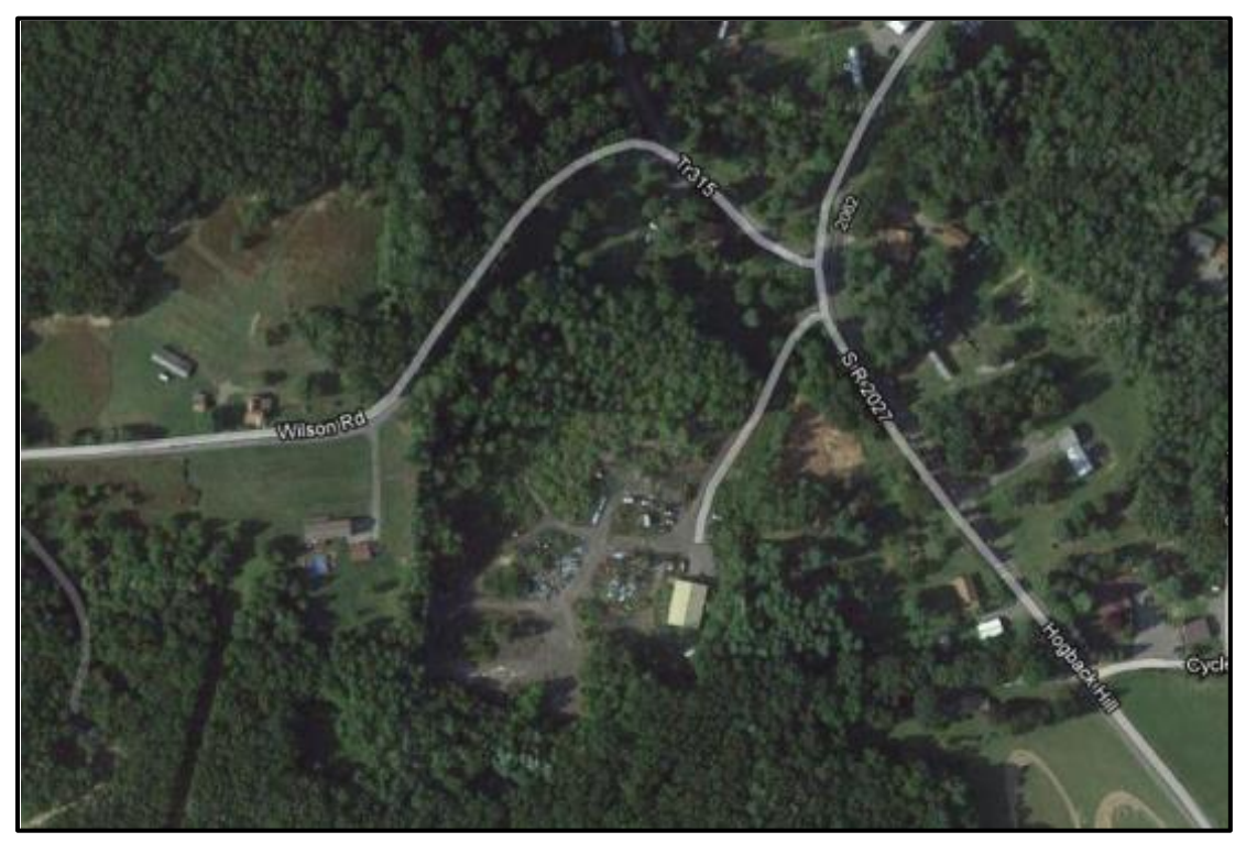
Site "A" Aerial Photo