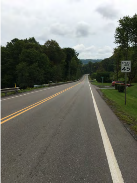
SR-153 S Krebs Highway, waterline location