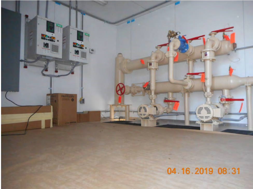
Inside pump station