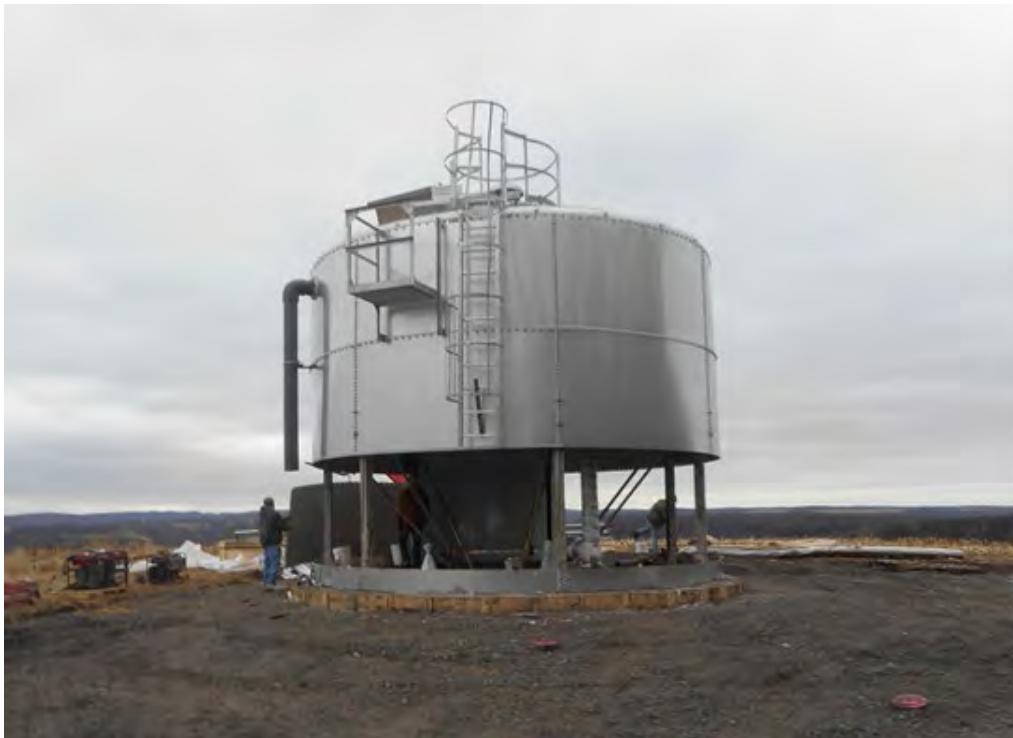
Water storage tank