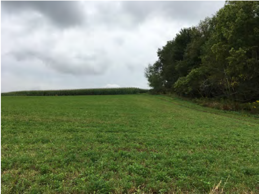
Water tank location