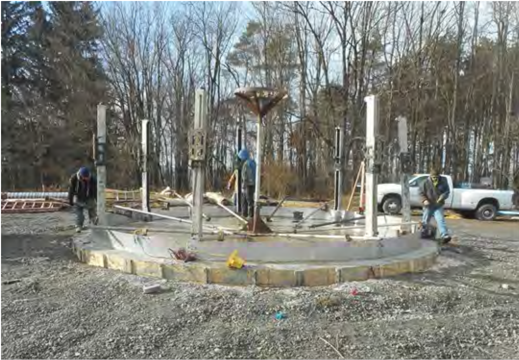
Water storage tank