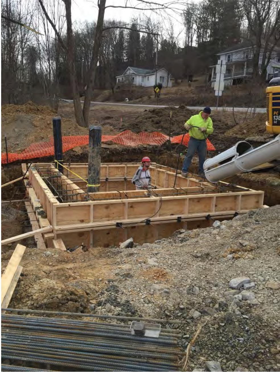
Pump station footer