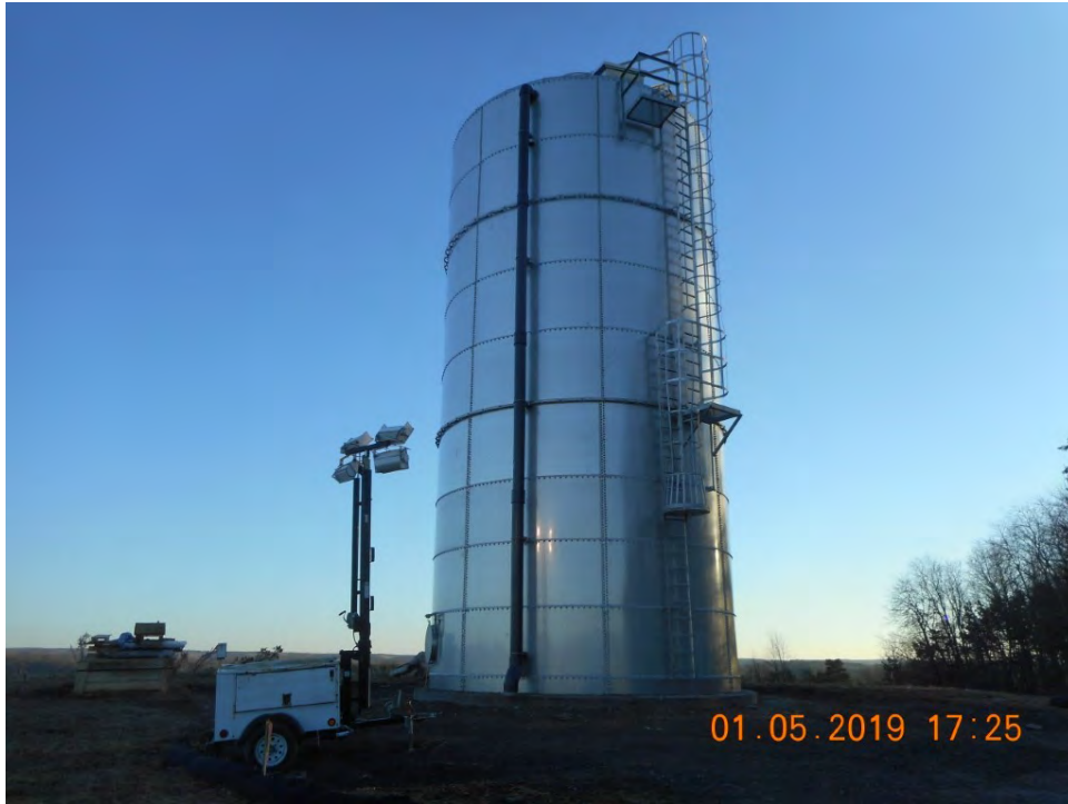
Water storage tank