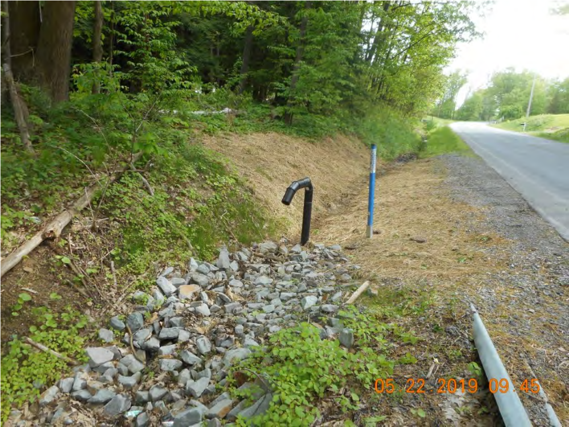
Waterline and blow off