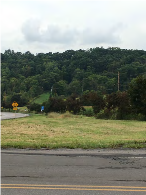
Pump station location