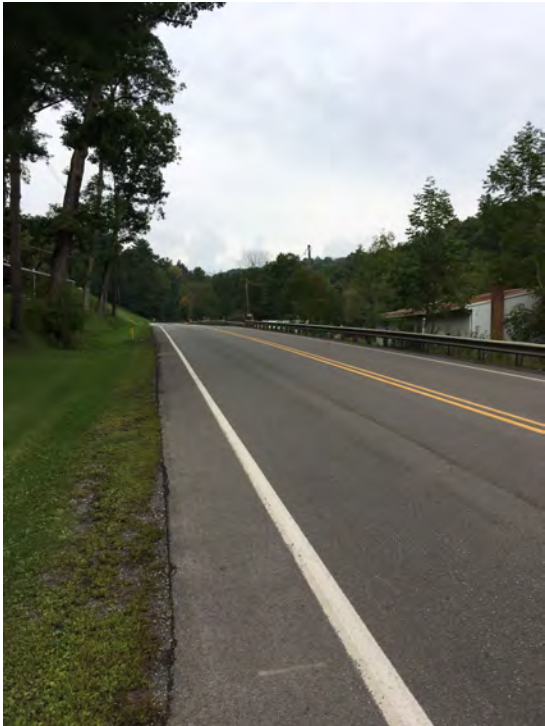
SR-153 N Krebs Highway, waterline location