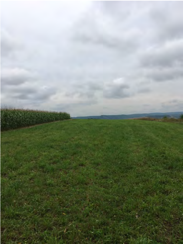
Water storage tank location