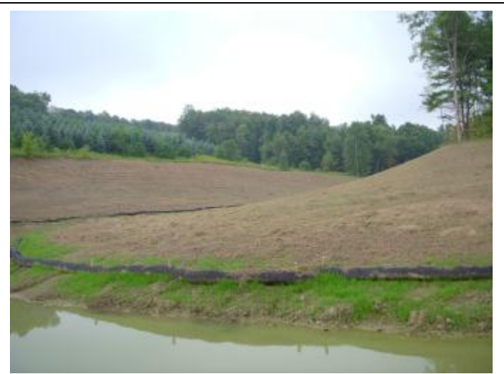
View looking SW from SR 729.