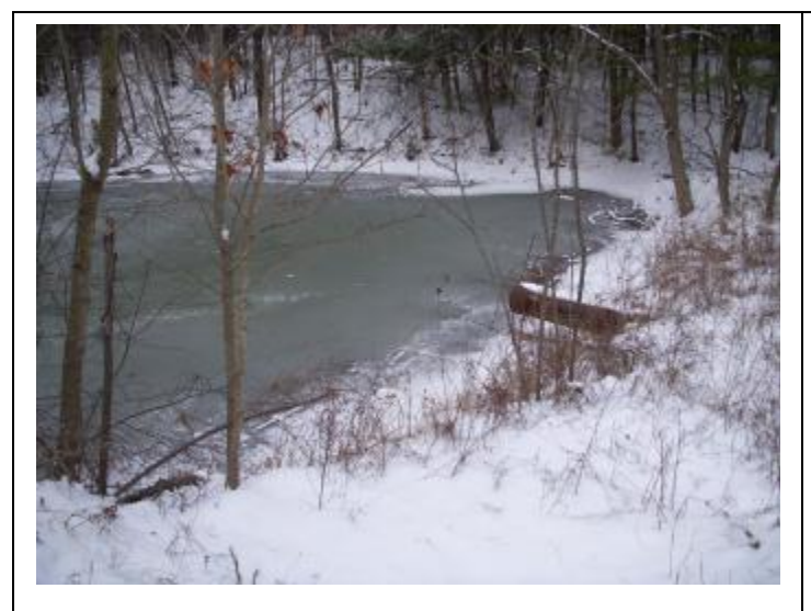
View of drainage pipe from roadway swale along SR 729.