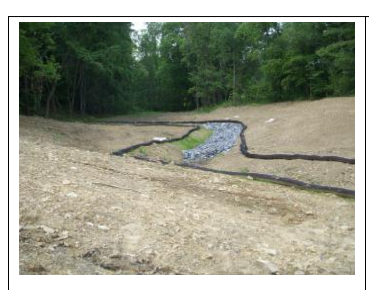
Looking SW from center of project.