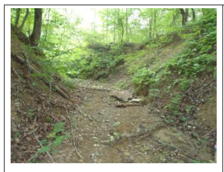
View of Potts Run Stream Channel located on the SW area of the project.