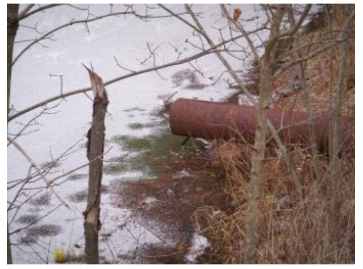
Close-up of water level below pipe from roadway swale.