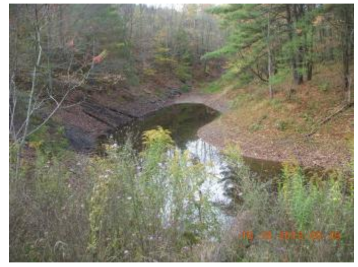
View looking SW from SR 729.