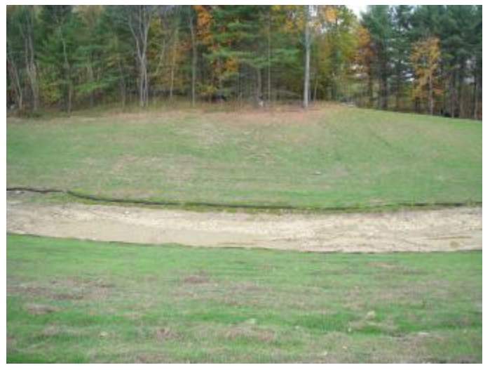
View looking North from Southern side of project.