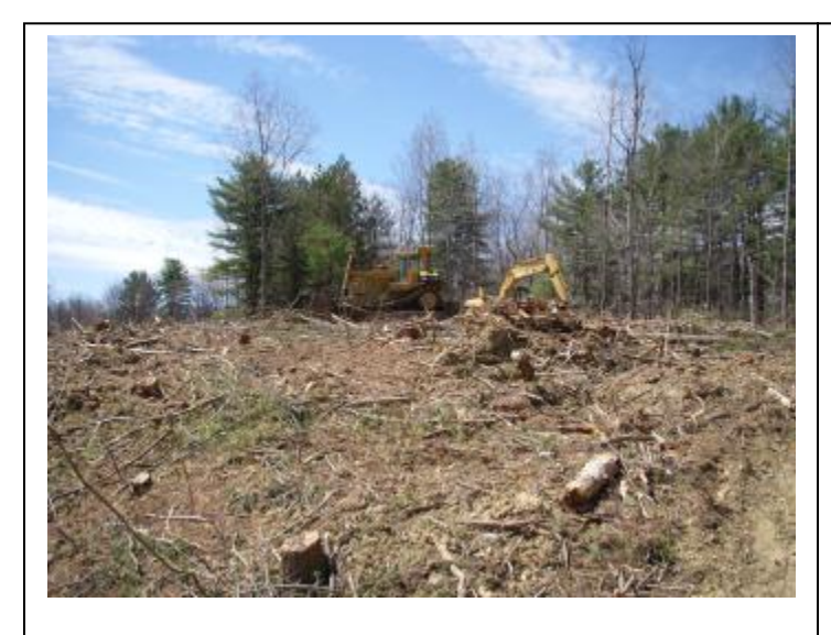
View looking toward upper tree line on Northern side of project from SR 729.