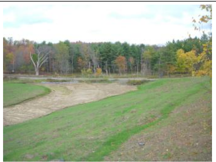
View looking East from Southern side of project.