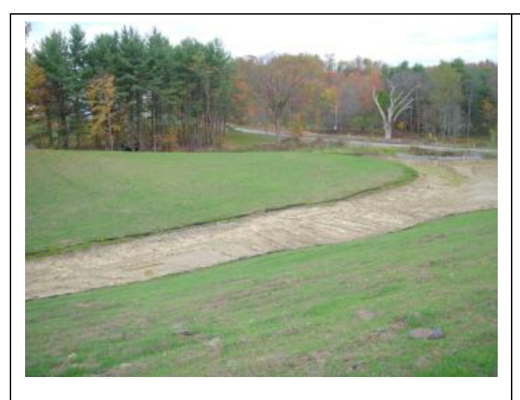
View looking NE from Southern side of project.