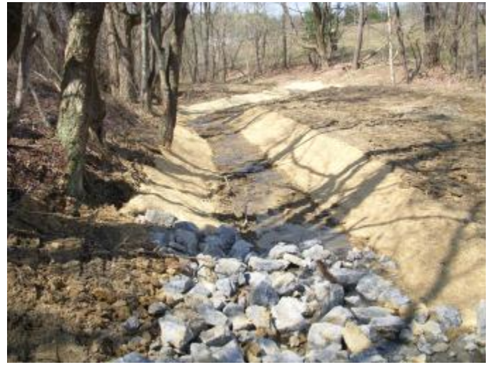
Pott's Run Stream channel work at SW end of job.