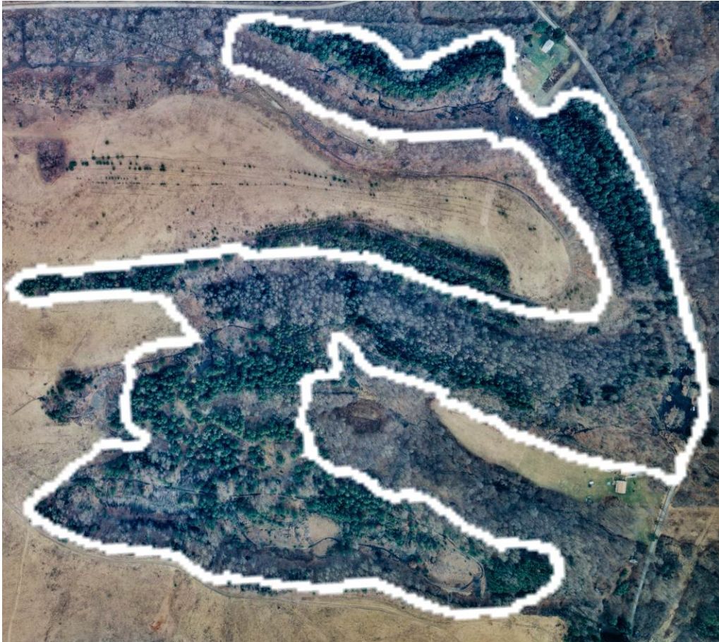
Aerial Photo of Approximate Grading Boundary