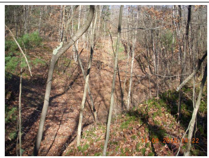
Steep Embankment & Water Impoundment