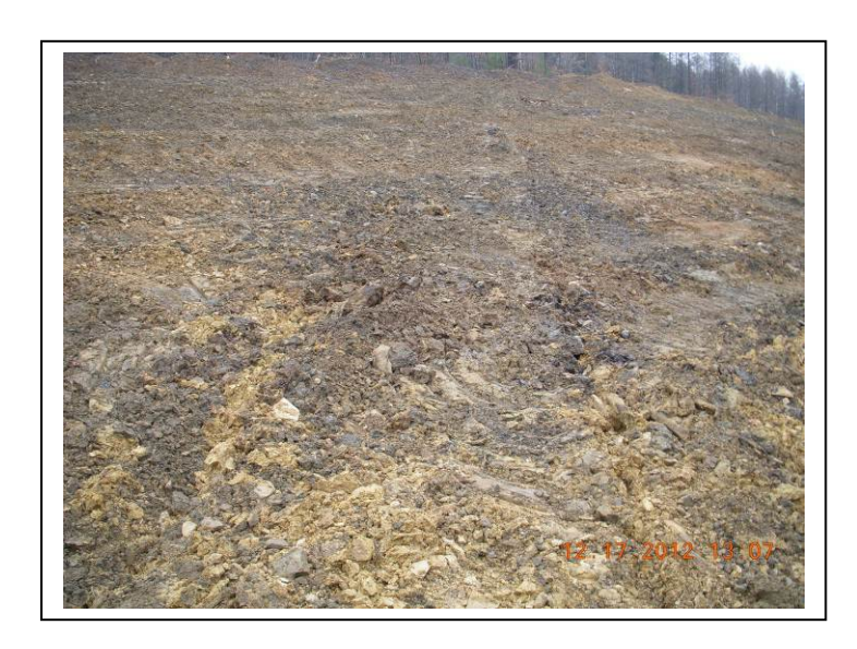
Ripped Area for Tree Planting