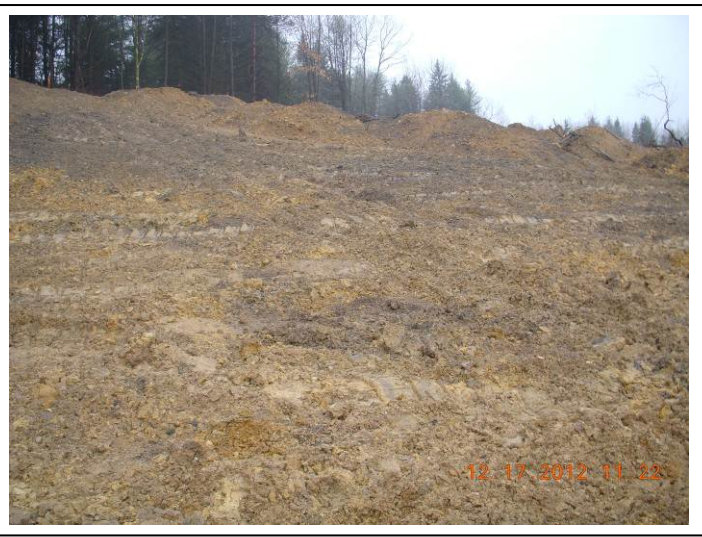
Hummocky Piles for Tree Planting