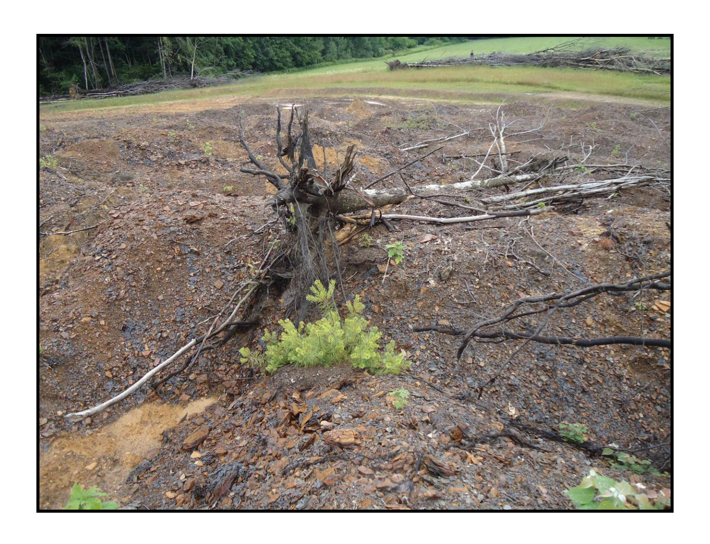
Hummocky Piles (Immediately after reclamation - August 2013)