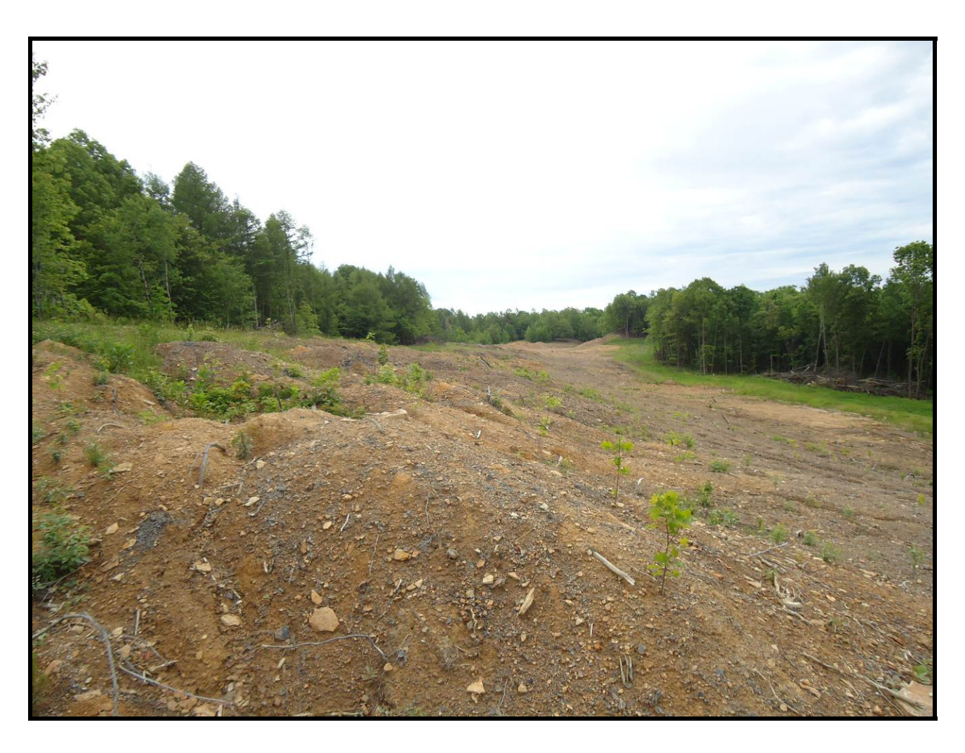
Hummocky Piles (One year's tree growth - May 2014)