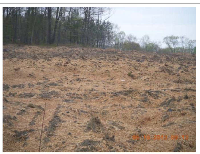
View of completed ARRI grading looking along western dogleg on Site B.