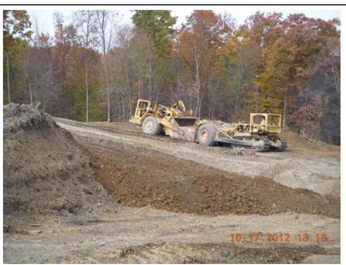
View of site grading looking along western dogleg on Site B.