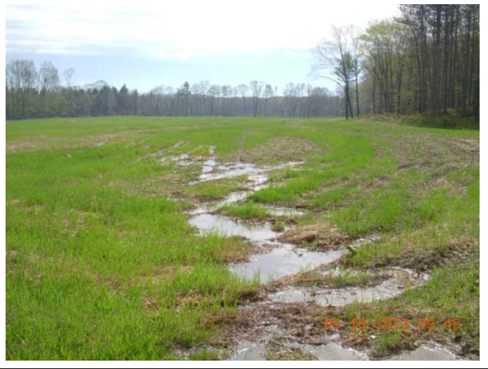
View of grass growing on Site A, looking east.