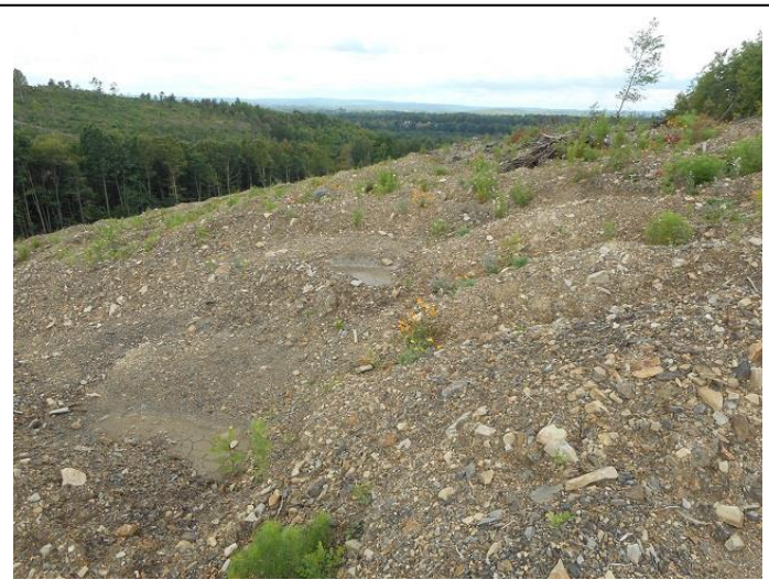
8/31/16 –ARRI/FRA hummocky piles with tree seedlings planted and seeded with wildflower mix on the northeast end of the site.