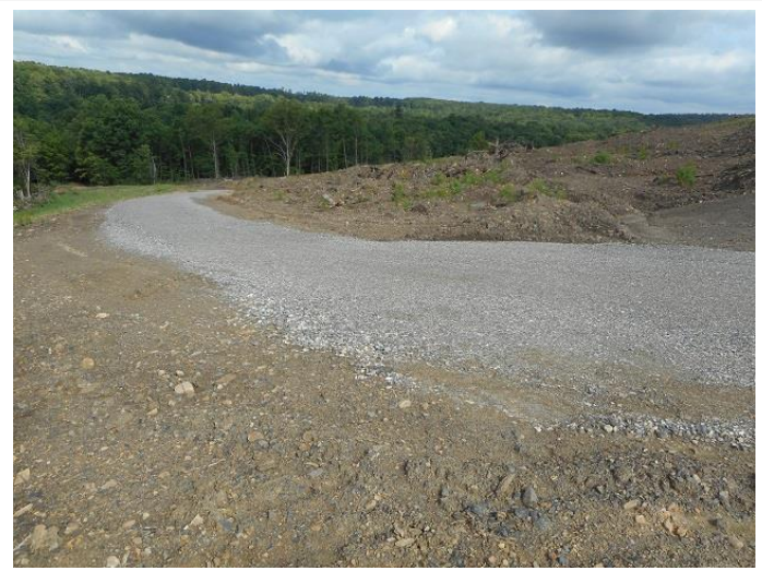
8/31/16 – Access road leading to the project on the south side of the site. ARRI/FRA hummocky piles with tree seedlings planted and seeded with wildflower mix.