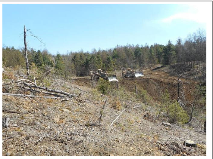
1/25/16 – Backfilling the pit and 60-foot highwall on the west side of the project site using two Cat D 11 dozers.