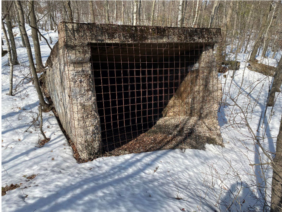
Looking Southwest at AML Feature 3209-17 (Portal), the dimensions of the portal are 8.5 feet tall by 13 feet wide.