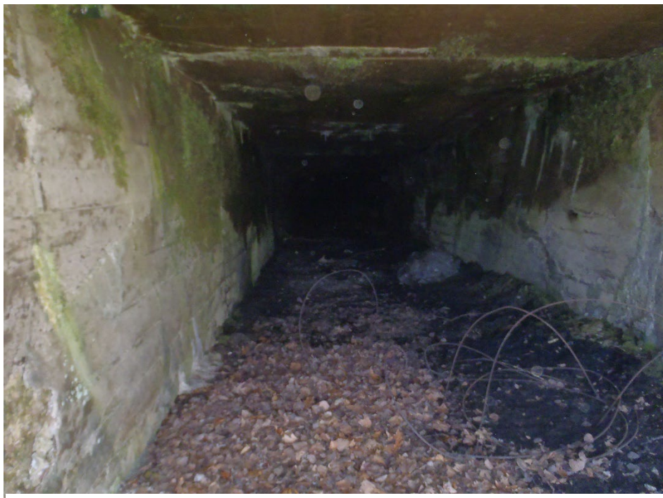
Looking inside the portal opening, the slope is made of concrete walls and extends for an unknown depth, but mine maps indicate it may be 1,200 feet to the mine workings.