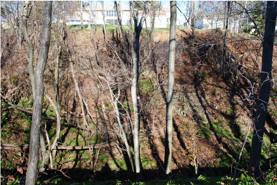
Pit immediately behind residents