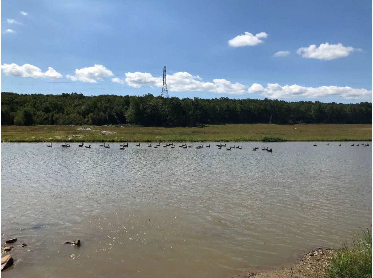
Constructed Pond for Use as Wildlife Habitat and Stormwater Management