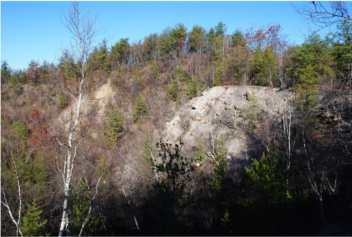
Dangerous Pile and Embankment