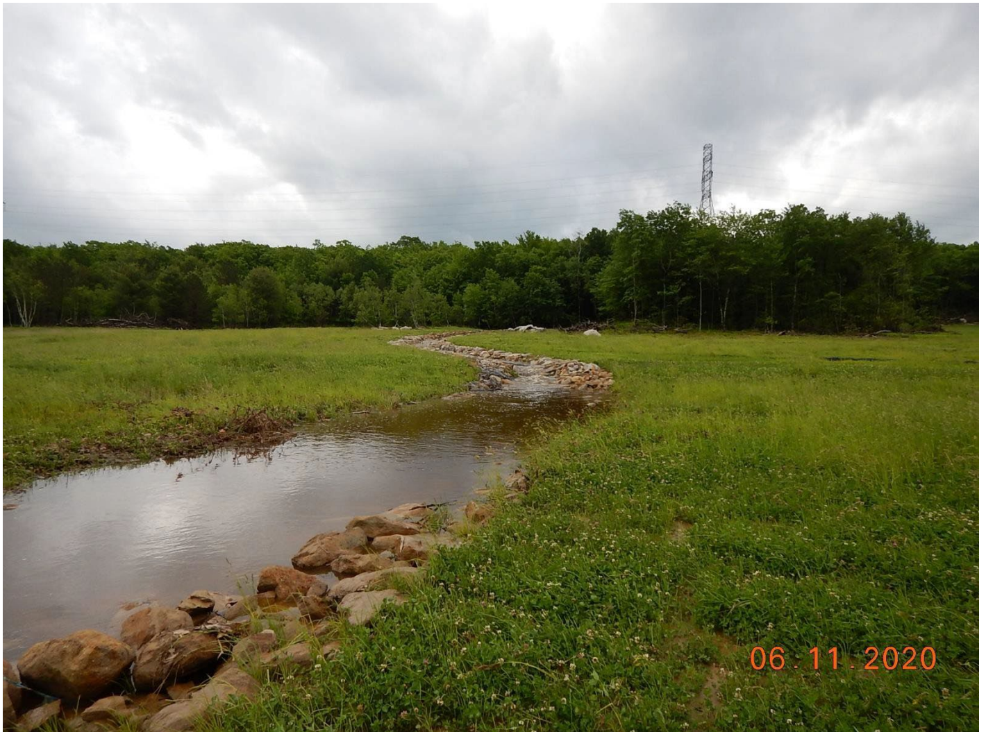
Reestablished Stream Channel