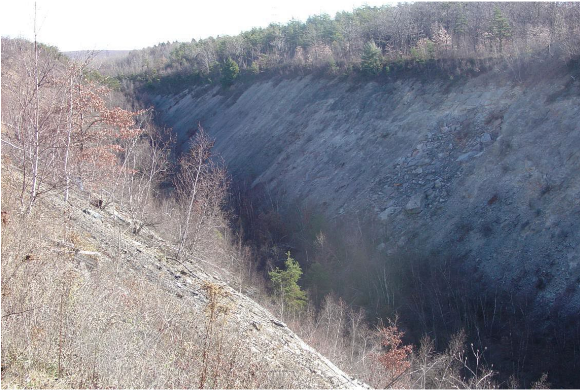
Looking East at Dangerous Highwall