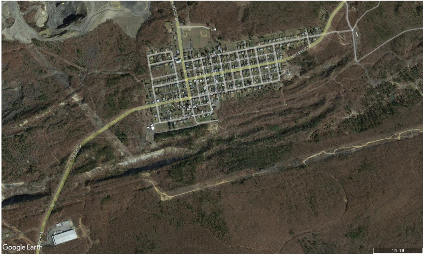
Google Earth Imagery