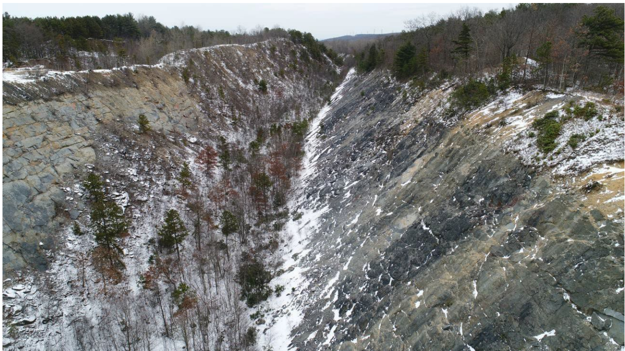
Drone Photograph of Dangerous Highwalls