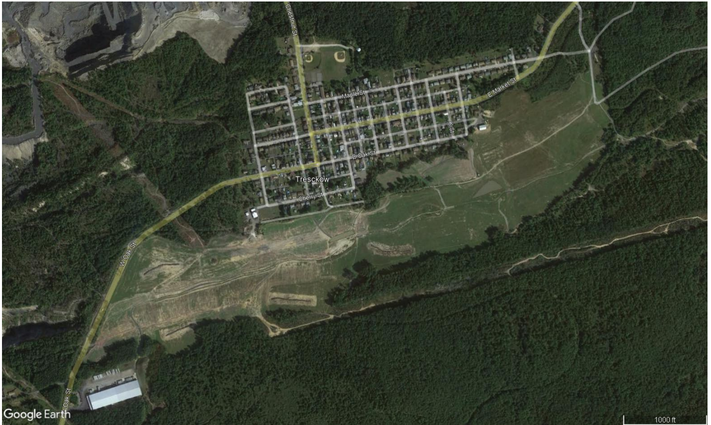
Google Earth Imagery