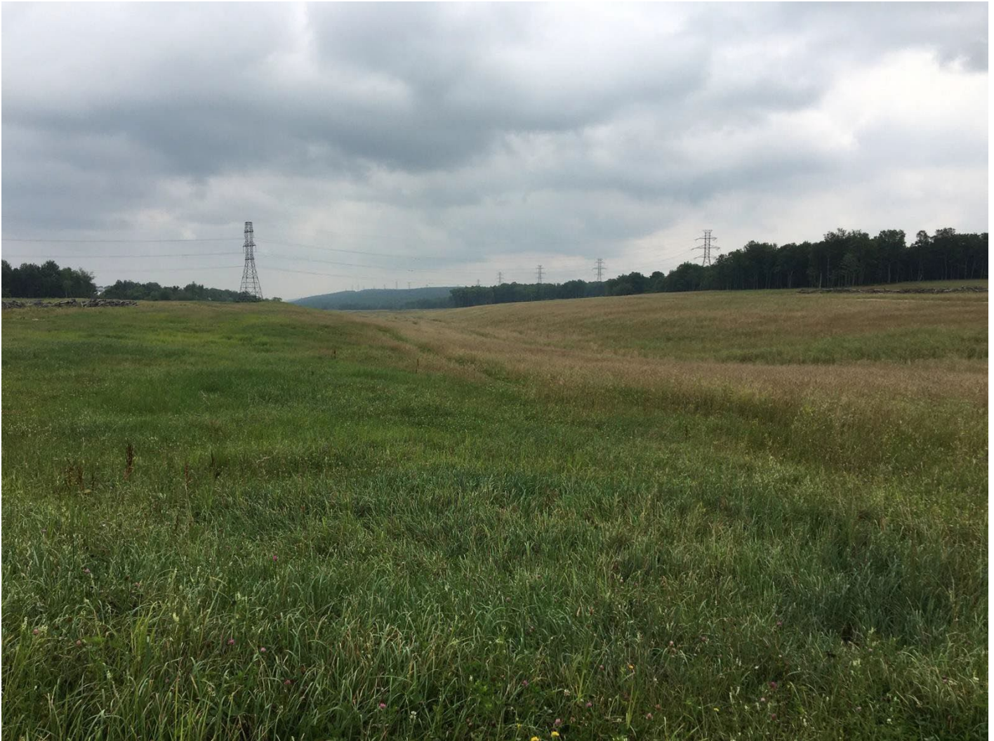
Reclaimed Dangerous Highwall